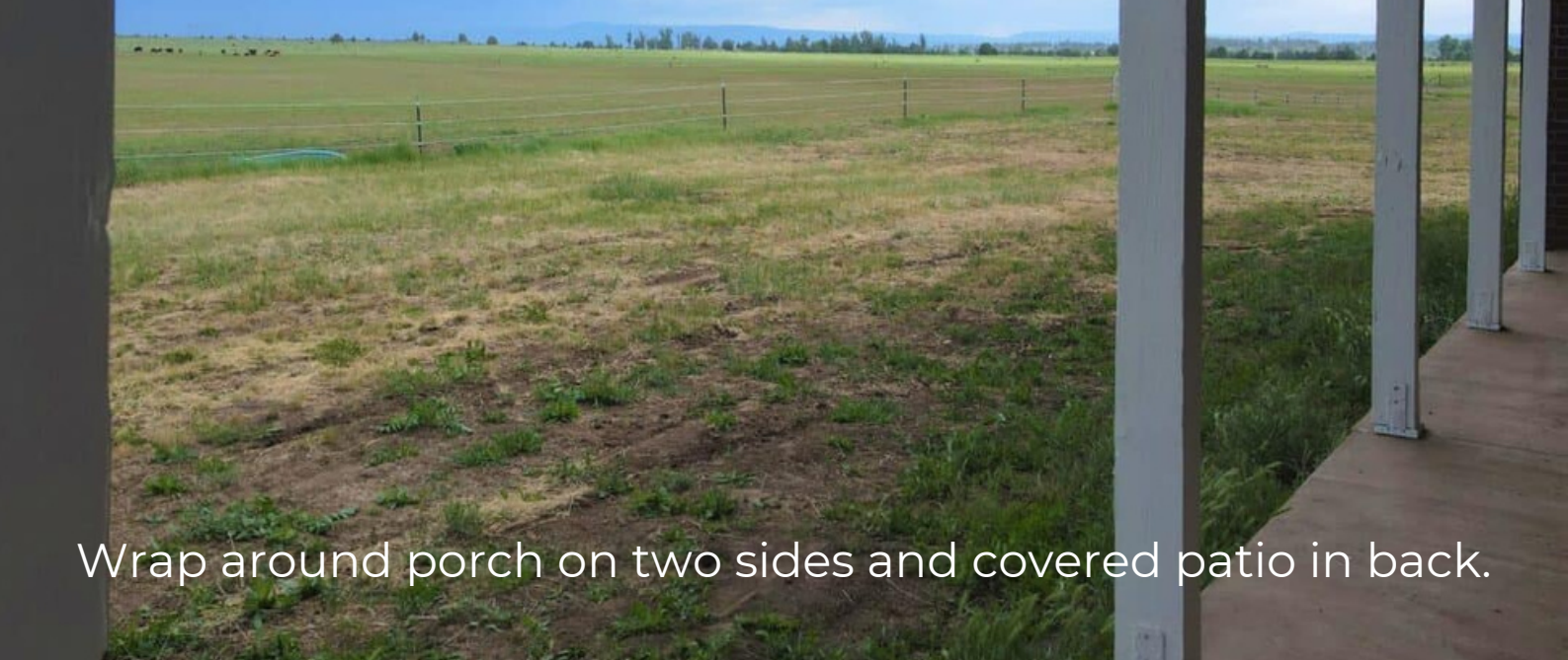
Wrap around porch on two sides and covered patio in back.