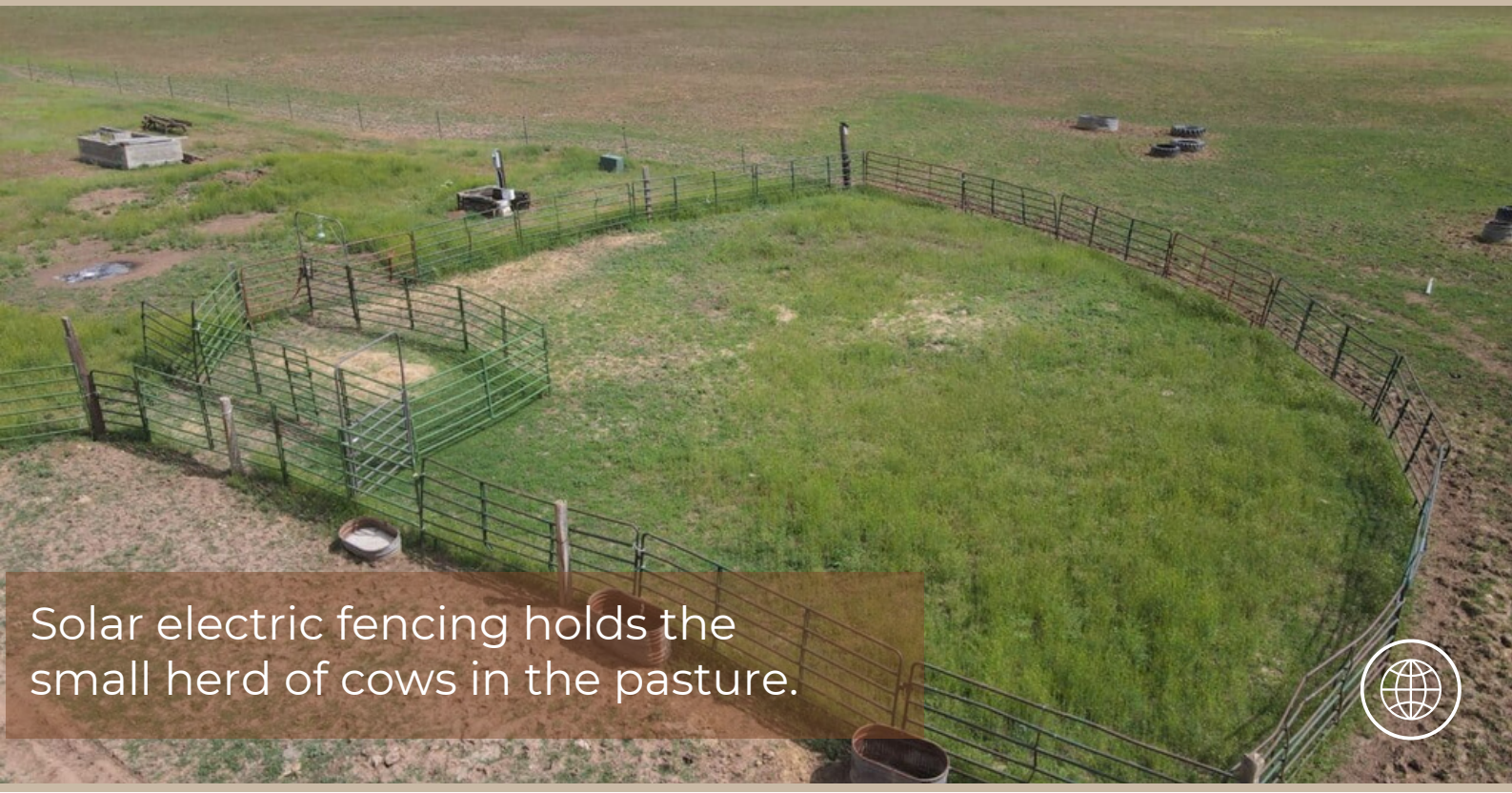
Solar electric fencing holds the small herd of cows in the pasture.