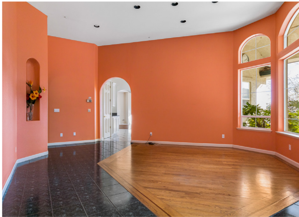
Formal Dining Room