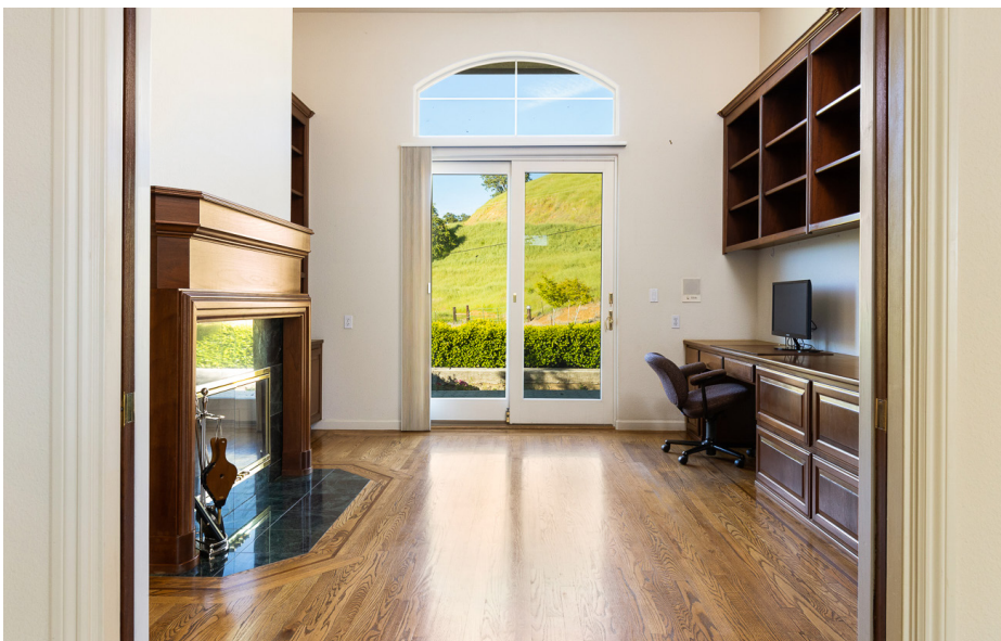
Office and/or Study Room

Nice large office with built-in desks, cabinet and bookshelves for added storage. There is also a fireplace and sliding door to a front patio.