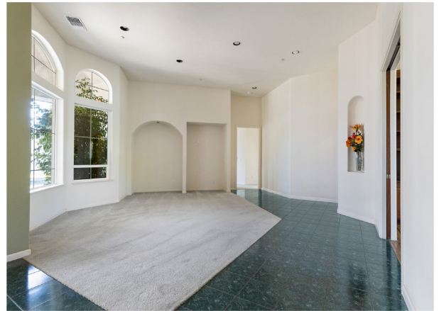
Formal Living Room