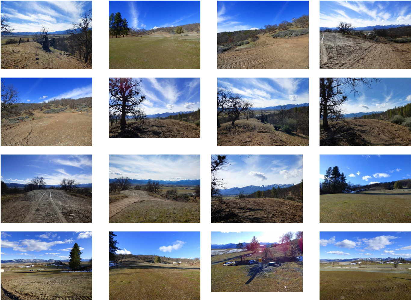
This information is deemed reliable but not guaranteed. These properties may be the listings of another 03/21/2019