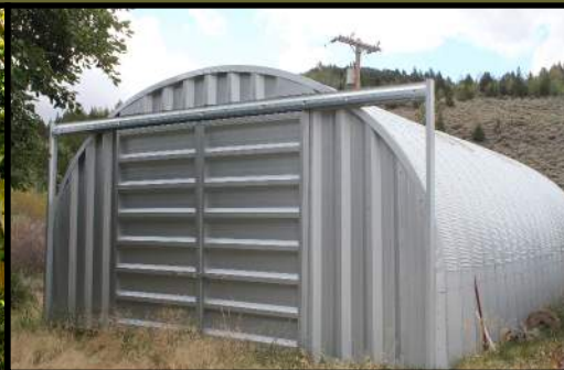
Left: The home and garage