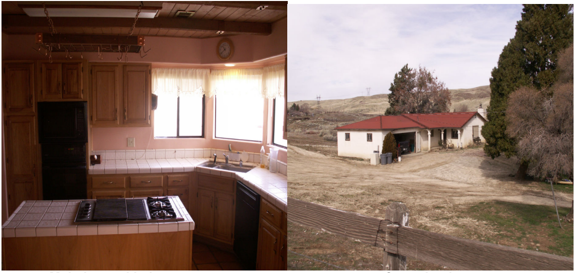
Main house kitchen