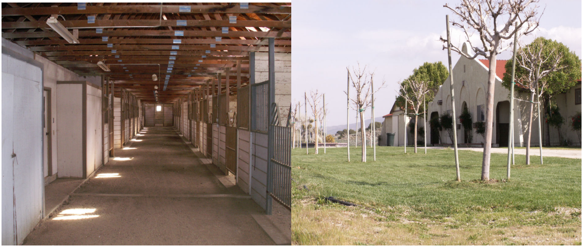
Inside one of the barns