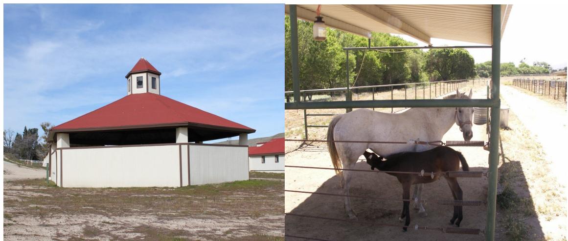
Covered Round Pen