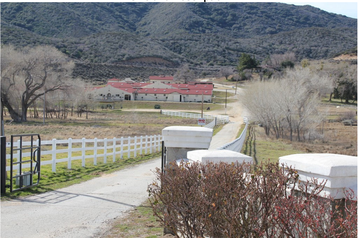
View looking south at equestrian center, 5/8 mile track on top

The property consists of two parcels, 3215-003-001 and 3215-018-012, totaling 78.16 acres and is zoned LCA22.