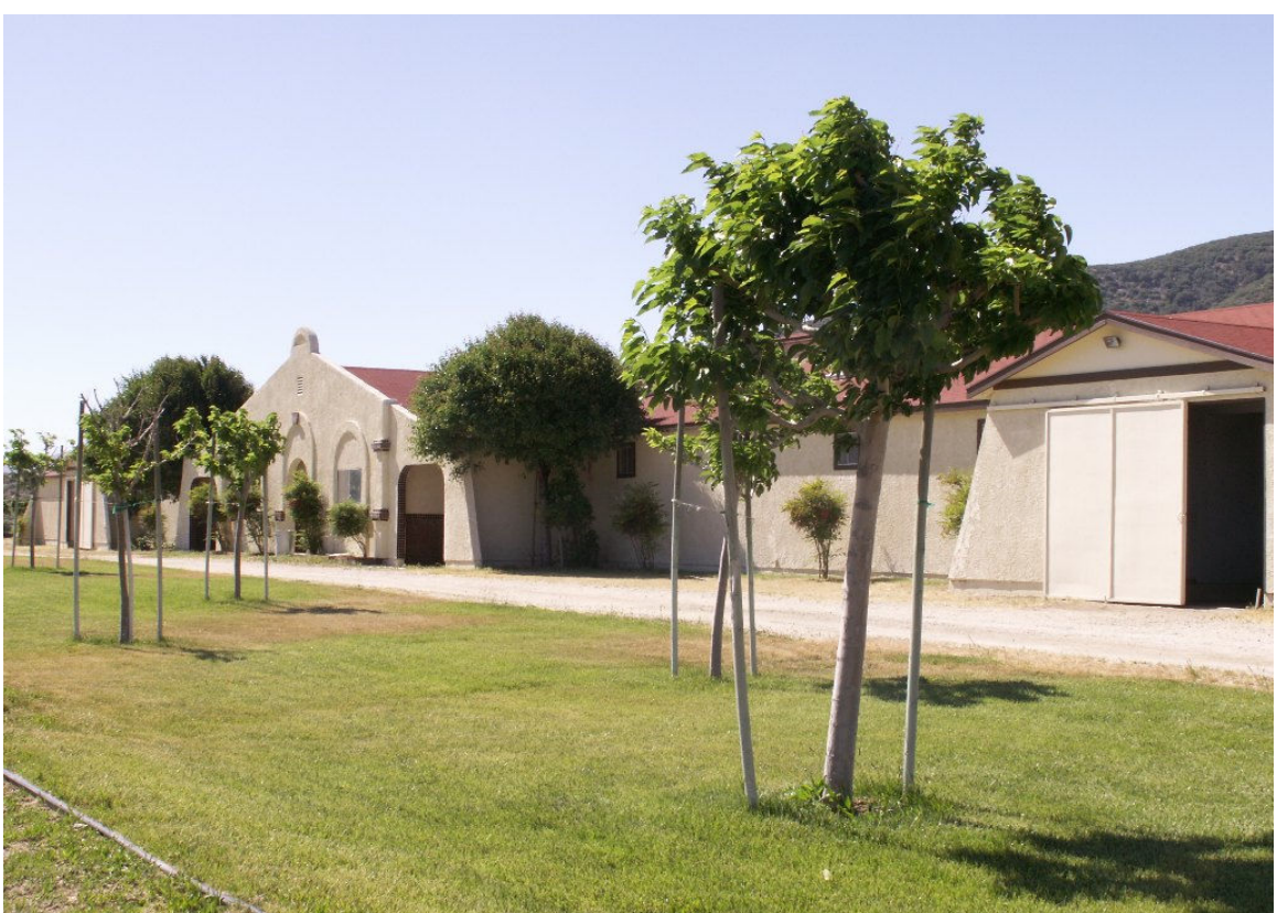
View of main barn looking South West

This is a serious equestrian property with miles of trails and training facilities. There is a nice Spanish style home that is roughly 2000 sq ft that sits above the stables with three bedrooms and three baths, fireplace, custom bar area and a detached two car garage. The other home is a couple hundred yards away. It is 3 bedrooms and two baths and about 1600 sq ft. The main barn has 36 indoor stalls, hay storage, wash racks, indoor lighting, water, two offices with kitchens and tack rooms. Barn #2 has 22 indoor stalls with 3 indoor washing bays, indoor lighting, water, two tack rooms and an outside washing bay. Barn # 3 has 10 indoor stalls, indoor lighting, water, office and an outside washing stall. Barn #4 has 15 indoor stalls, indoor lighting, water, tack room, outdoor wash rack and horse walker. The covered round pen is sand filled and measures 57 ft diagonally. Above the facilities is a 5/8 mile exercise track. If you are into roping this ranch has one of the nicest roping arenas around the area; all metal construction over 300 ft long, alleys, squeeze chute, header and heeler stations, grand stands, and 4 large holding pens for cattle. There are also 12 covered outdoor metal stalls for your roping guests. This equestrian center has it all and just needs someone to come in and make it happen.