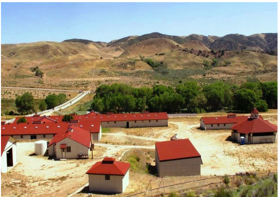
Looking East towards the Petersen Ranch

This 78.16 +/- acre ranch is located in the northern section of Los Angeles County approximate 10 miles west of Lancaster, CA and 20 miles northeast of Santa Clarita, CA. You can leave Beverly Hills in your suit and tie and be on the ranch riding horses in a 1½ hour drive. The Equestrian Center is only 15 minutes from a 7000 ft runway, perfectly capable of handling a Gulf Stream and is only 83 miles from LAX and 68 miles from Burbank airport. The equestrian center in its day was one of the finest in the area. There are 4 Spanish style barns with a total of 83 indoor stalls, plenty of hay storage, office space, apartments, 12 covered outdoor metal stalls, a 57 ft covered round pen, one of the finest all metal 300 ft. roping arena's in the area, with a squeeze chute, grand stands, water and power, and 4 holding pens for cattle. There is also a 5/8 mile track to exercise your horses which the property owns half. The main home is 2000 sq with two caretaker homes. With a little TLC this could be one of the top Equestrian Centers in California.