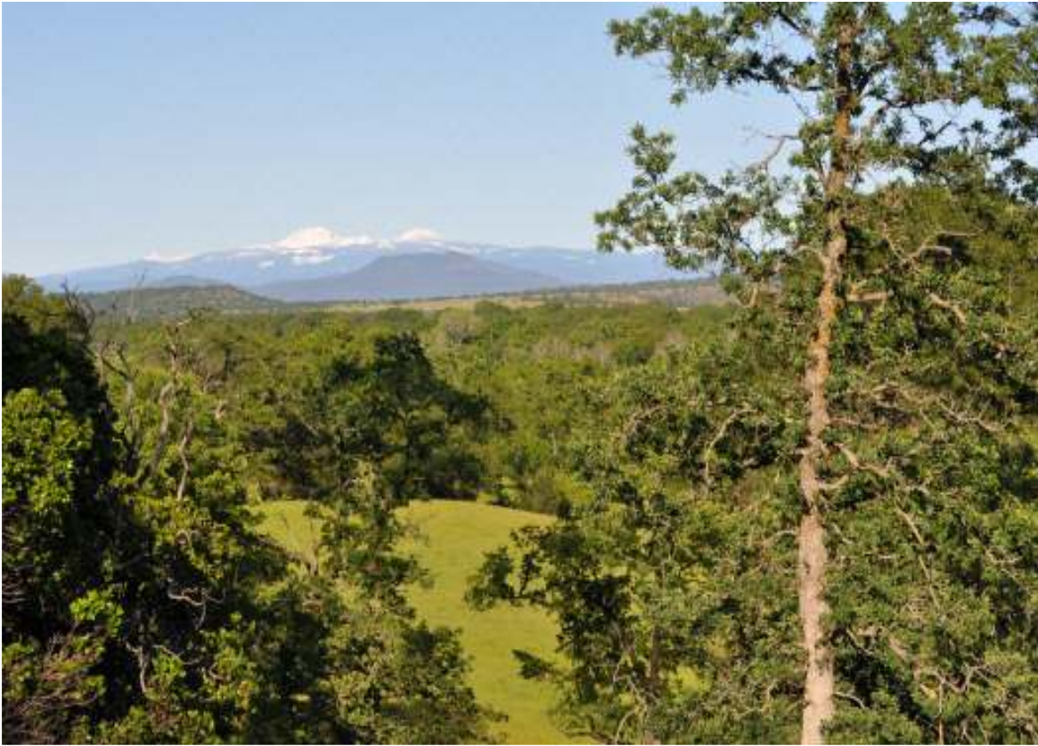
Looking Northwest from Lookout Mountain

The property consists of a 20.6 acre parcel. There is a current Parcel Map on file with Tehama County Planning Department #10-01. Before escrow can close the road into the parcel will need to be completed. Once the road is completed, the county will assign an APN # and the parcel map will be approved. The property is pie shaped with the longest stretch along the Sacramento River. The property has over 1675' feet of river frontage. The property is flat along the river and gradually rises as you get away from the river. Lookout Mountain rises 258' feet from the river bank and provides a spectacular view of the river, mountains and area. The property has a nice seasonal creek that flows into the Sacramento River and is a favorite hangout with the beavers and otters. There is definitely a special feeling as you walk around this property and take in the ambience.