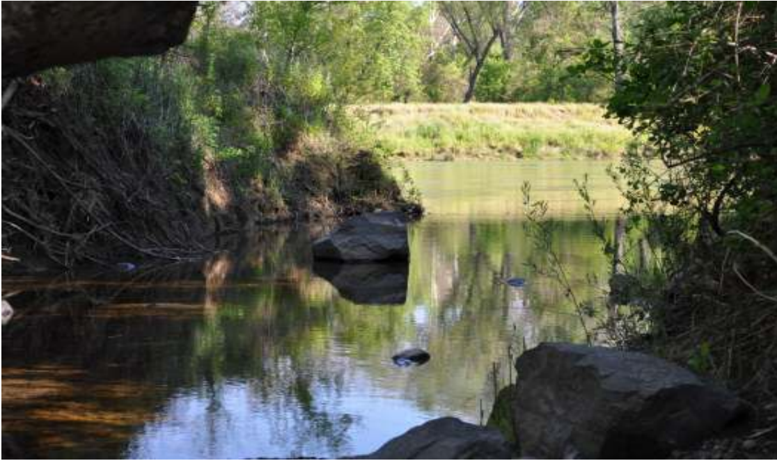
Creek flowing into Sacramento River

The property will need a well drilled for water. The neighboring parcel has a ____ foot deep well and they get ____ GPM. The property has over 1675' of Sacramento River frontage.