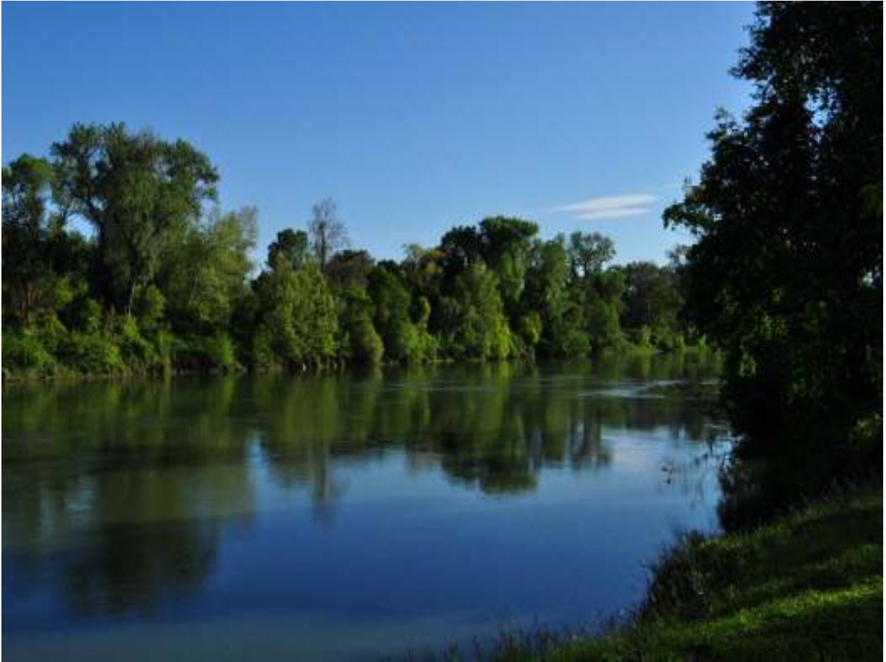
Looking East from the property banks

This 20.67 +/- acre property is located in Tehama County about 9 miles northeast of Red Bluff, CA. Red Bluff is located in the heart of the Sacramento Valley, 144 miles north of Sacramento, CA and 194 miles north of San Francisco, CA. The property is 12 miles from the Red Bluff airport with a 5700 ft asphalt runway. Commercial flights can be found in Sacramento, 144 miles away, and Redding, CA just 30 miles away. Chico is a great college town and is only 51 miles away. The property is reached by traveling North on Interstate 5, turn east on Jelly's Ferry Road. Please call the office for a showing. This is a gem of a property. River frontage on the Sacramento River is a much sought after treasure in California. This parcel has it all. Flat river frontage, rolling oak covered grass lands and part of Lookout Mountain. It has beautiful views of Mt. Lassen and Mt. Shasta and of course the magnificent Sacramento River for over 1675' feet. The real gem of this property, besides its spectacular setting, is its location. It is the last parcel of the four parcel subdivision and is surrounded by a big cattle ranch. This property would work for the equestrian lover, nature lover or the avid outdoorsman that loves to hunt and fish right out their back door. This is a jewel and needs to be seen to appreciate.