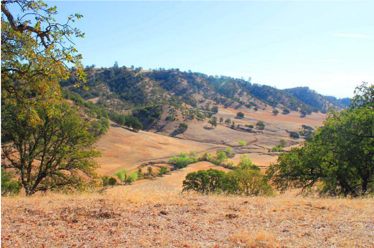
Looking East (9-29-11)

This 5101 +/- acre ranch is located about 21 miles (40 minutes) west of Red Bluff, CA. Red Bluff is your quintessential cowboy town with 14,000 residents, great shopping, restaurants, hospital and the mighty Sacramento River. Red Bluff is known for its Bull and Gelding sale in January and the Red Bluff rodeo in April. Red Bluff has a great airport with a 5700' x 100' paved runway for your private plane. For commercial flights, Redding, CA (90,000 population) is just 20 minutes up the road. Sacramento, CA is 125 miles from Red Bluff and San Francisco is 186 miles. Historically, the ranch has run 300 pair for the winter season. The cows are moved down from the headquarters ranch in Lassen County to Red Bluff in November and moved back to Lassen County in mid May. From Red Bluff take Main Street to Walnut Street and make a left, follow Walnut for several miles and make a left on Wilder road. Take Wilder road for about 4.5 miles and make a right on Reeds Creek road. Take Reeds Creek road for 4.75 miles and make a left on Johnson road. In 2.75 miles make a right on Johnson road, in less than a mile turn left on Joint road. The pavement will end and you will follow the road and it turns into Balis Bell road. Follow the county maintained gravel road for about six miles and you will come to a locked gate.