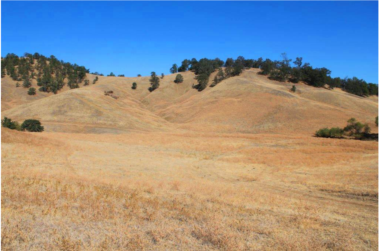
Looking east at the hills by the ranch headquarters (9-29-11)

The 5101 +/- acres is currently in 12 tax parcels. The property is zoned EAAP (Exclusive Ag) and is currently enrolled in the Williamson Act.