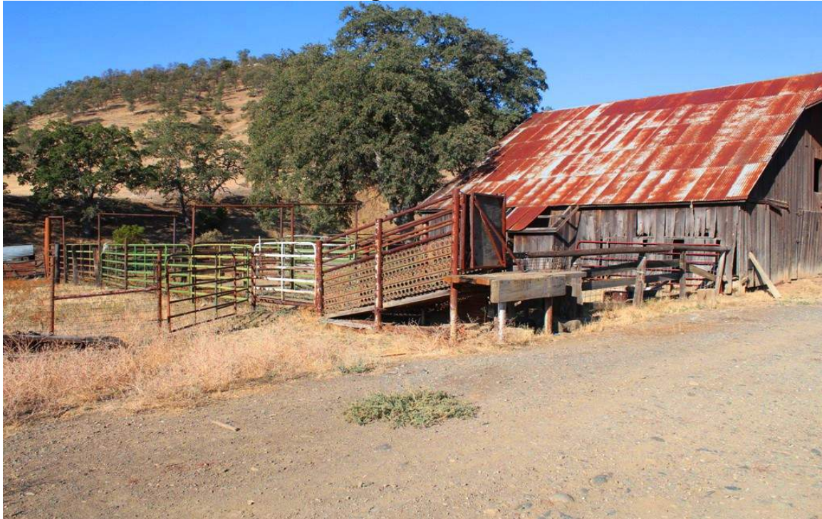
The corrals on the ranch (9-29-11)

The Crook Ranch's rolling hills with ranch elevation from 1000 ft to 1520 ft make it a great 300 mother cow or 1000 yearling operation. The weather really dictates the number of Animal Units. In some years you can run more and in some years you have to run less. It has been traditionally used as a winter grazing outfit with the cows arriving in mid November and shipped out in mid-May. The abundant rainfall during the winter months allows the grasses to grow and no need to feed hay. In mid-May the cows are trucked to summer pasture at the head quarters ranch which allows them to be on green grass all year round. Without having to put up hay the owner can justify the cost of trucking. The ranch is fenced and crossed fenced with good solid barbed wire. The corrals are located on the ranch. They are older, but operational. Like most ranches in the foothills, the seasonal streams and reservoirs fill up from the fall rains. The pastures are fertilizer and pesticide free making it a potential natural beef operation.