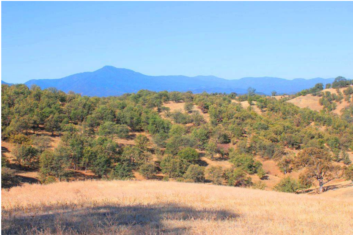
Looking west (9-29-11)

Red Bluff, California is the Tehama County seat is just 21 miles from the ranch. Red Bluff is located on the Sacramento River, which provides endless varieties of outdoor recreation. The Sacramento River is well known for being one of the largest salmon spawning rivers in the world. Red Bluff holds a “Bull and Gelding” sale every January and also hosts a rodeo in the spring which is one of the largest in the nation. As stated on the Red Bluff website: