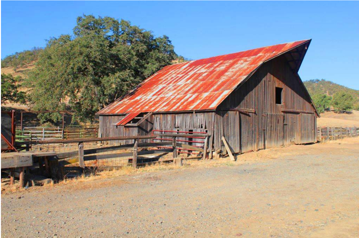
The old barn on the ranch (9-29-11)

The old homestead on the ranch is in a tear down condition, but the barn is very functional. It measures 45' x 51'. The corrals are functional, but older. The old homestead has a newer drilled well and, of course, the hand dug homestead well is still working.