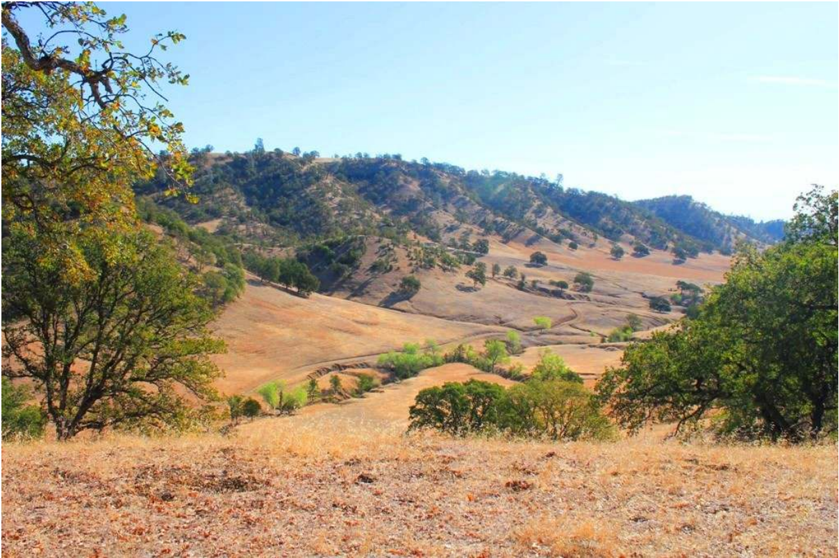
Looking East (9-29-11)

This 5101 +/- acre ranch is located about 21 miles (40 minutes) west of Red Bluff, CA. Red Bluff is your quintessential cowboy town with 14,000 residents, great shopping, restaurants, hospital and the mighty Sacramento River. Red Bluff is known for its Bull and Gelding sale in January and the Red Bluff rodeo in April. Red Bluff has a great airport with a 5700' x 100' paved runway for your private plane. For commercial flights, Redding, CA (90,000 population) is just 20 minutes up the road. Sacramento, CA is 125 miles from Red Bluff and San Francisco is 186 miles. Historically, the ranch has run 300 pair for the winter season. The cows are moved down from the headquarters ranch in Lassen County to Red Bluff in November and moved back to Lassen County in mid May. From Red Bluff take Main Street to Walnut Street and make a left, follow Walnut for several miles and make a left on Wilder road. Take Wilder road for about 4.5 miles and make a right on Reeds Creek road. Take Reeds Creek road for 4.75 miles and make a left on Johnson road. In 2.75 miles make a right on Johnson road, in less than a mile turn left on Joint road. The pavement will end and you will follow the road and it turns into Balis Bell road. Follow the county maintained gravel road for about six miles and you will come to a locked gate.