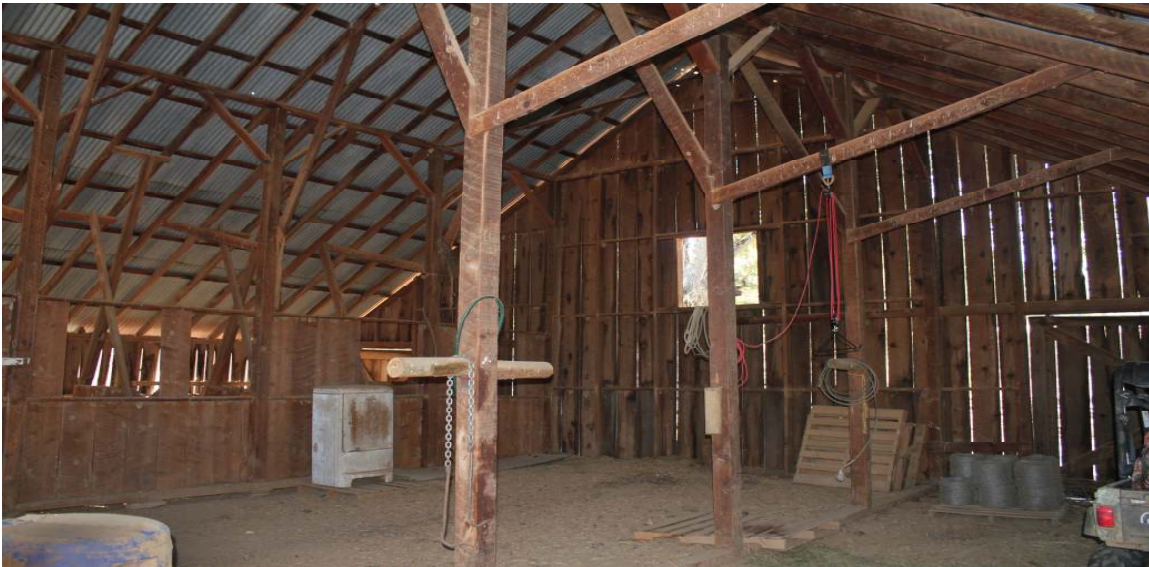
Inside the barn (9-29-11)

The old homestead on the ranch is in a tear down condition, but the barn is very functional. It measures 45' x 51'. The corrals are functional, but older. The old homestead has a newer drilled well and, of course, the hand dug homestead well is still working.