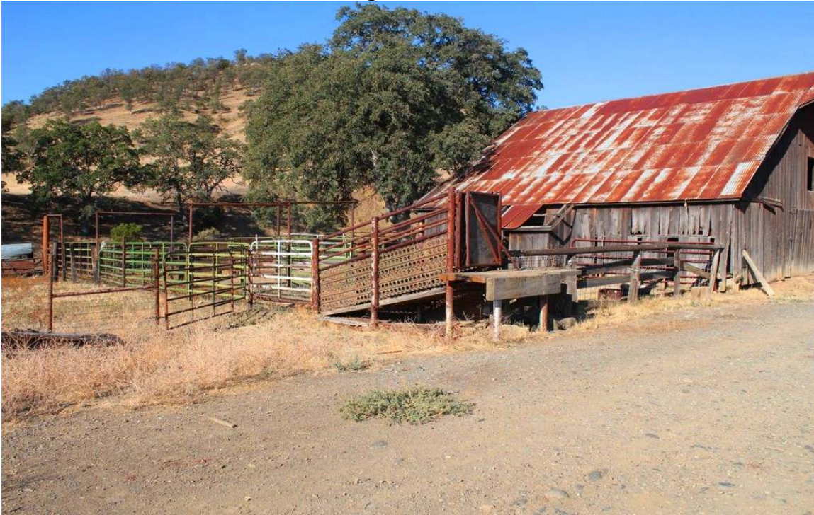
The corrals on the ranch (9-29-11)

The Crook Ranch's rolling hills with ranch elevation from 1000 ft to 1520 ft make it a great 300 mother cow or 1200 yearling operation. The weather really dictates the number of Animal Units. In some years you can run more and in some years you have to run less. It has been traditionally used as a winter grazing outfit with the cows arriving in mid November and shipped out in mid-May. The abundant rainfall during the winter months allows the grasses to grow and no need to feed hay. In mid-May the cows are trucked to summer pasture at the head quarters ranch which allows them to be on green grass all year round. Without having to put up hay the owner can justify the cost of trucking. The ranch is fenced and crossed fenced with good solid barbed wire. The corrals are located on the ranch. They are older, but operational. Like most ranches in the foothills, the seasonal streams and reservoirs fill up from the fall rains. The pastures are fertilizer and pesticide free making it a potential natural beef operation.