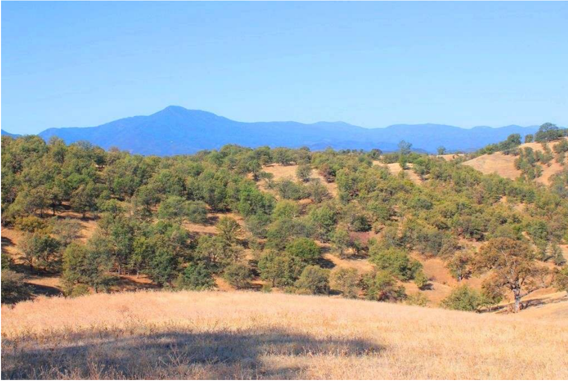
Looking west (9-29-11)

Red Bluff, California is the Tehama County seat is just 21 miles from the ranch. Red Bluff is located on the Sacramento River, which provides endless varieties of outdoor recreation. The Sacramento River is well known for being one of the largest salmon spawning rivers in the world. Red Bluff holds a “Bull and Gelding” sale every January and also hosts a rodeo in the spring which is one of the largest in the nation. As stated on the Red Bluff website: