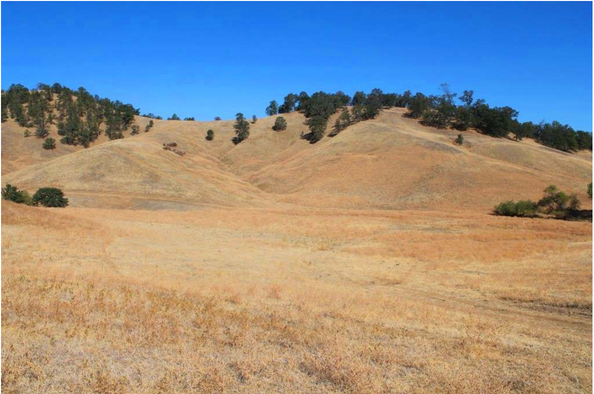
Looking east at the hills by the ranch headquarters (9-29-11)

The 5101 +/- acres is currently in 12 tax parcels. The property is zoned EAAP (Exclusive Ag) and is currently enrolled in the Williamson Act.