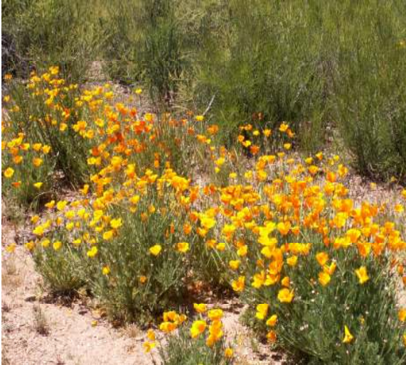
Poppies in spring