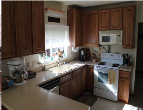
Main home kitchen

This 1500 sq ft 3 bedrooms, 2 baths home is nicely cared for and move in ready condition. The headquarters has a great barn, shop, guest cottage and caretaker home. The grounds are well maintained, fenced and with lots of room for vehicles and equipment.