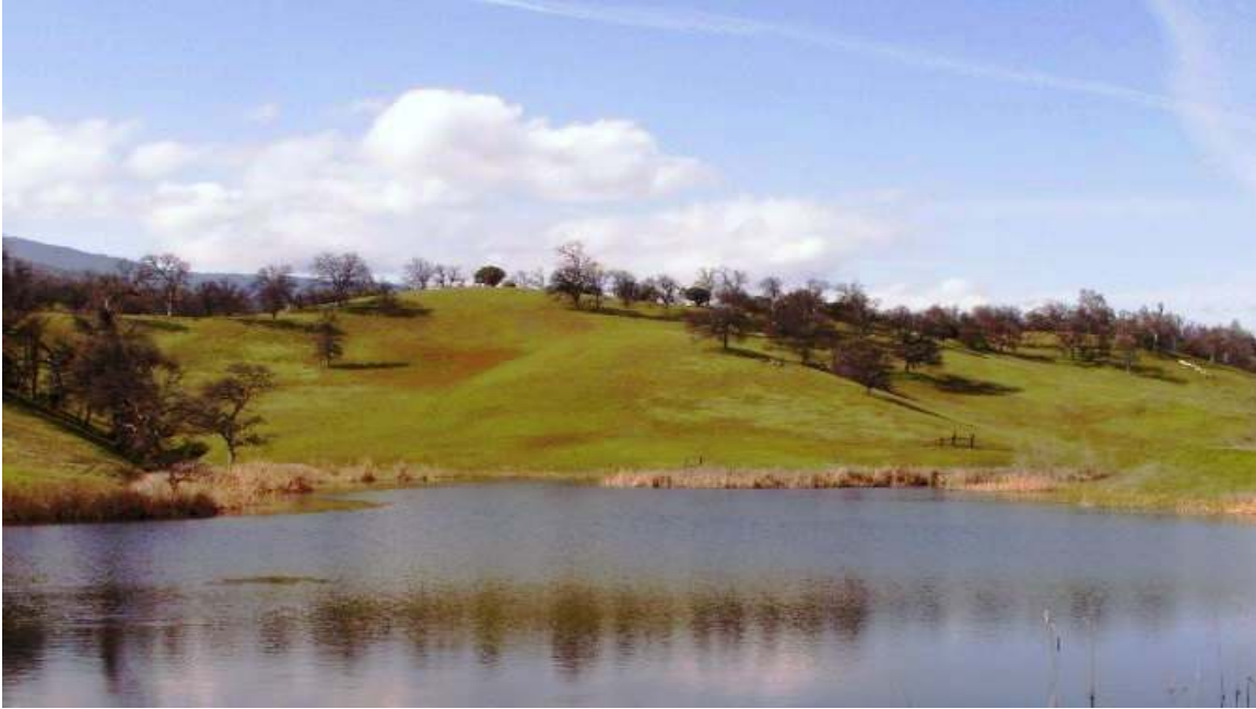
One of the seven year round ponds, Feb 2011

Water is gold and this ranch has lots of it. The seven ponds provide water year round and sustains great wildlife habitat. Green Valley creek is seasonal, but has good water flow in the winter time and runs for almost 5 miles. There is also a year round creek with over 3000' ft frontage on both sides, known as Briscoe creek, that will keep the fisherman happy. The headquarters home is fed from a well and provides plenty of water for the house and landscape. The other modular home is fed from its own well.