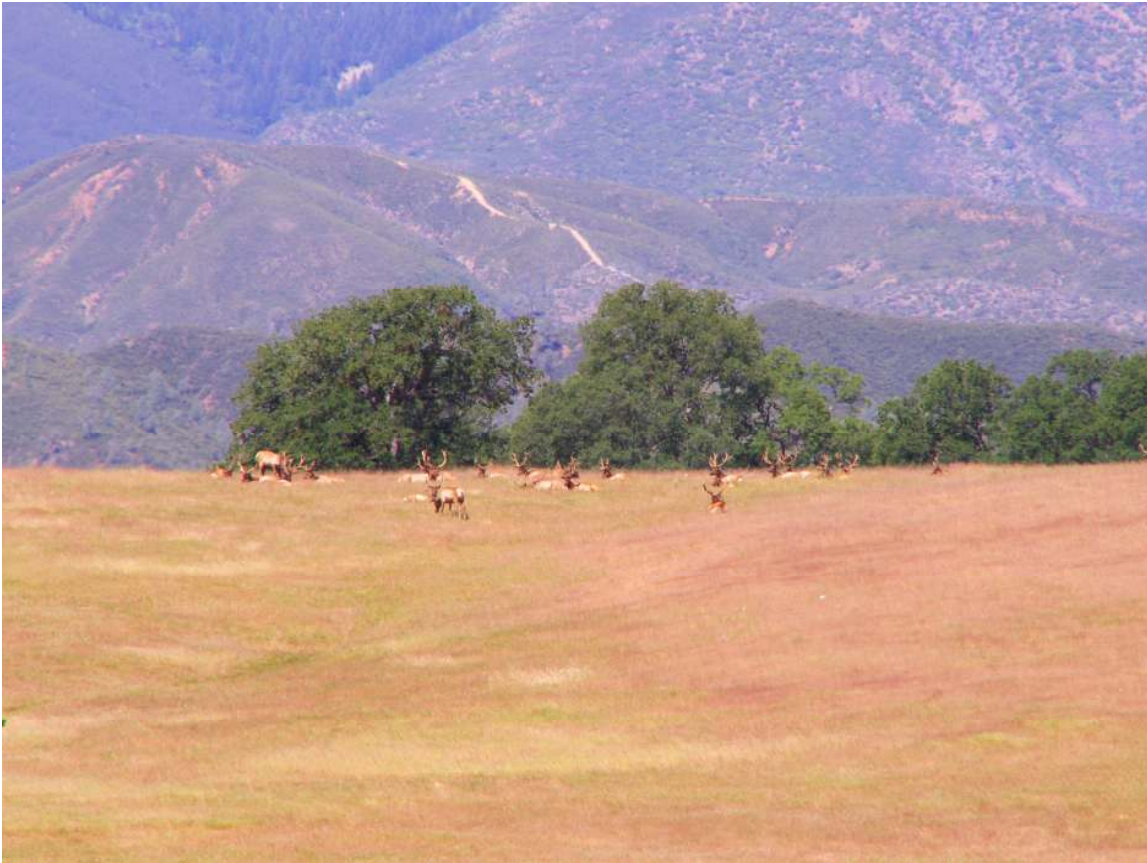
A herd of Elk just a few miles from the ranch

This is a recreational dream with big oak grassy valleys that blend into the hills. The hills of chaparral have manzanita, buckeye, chemise, redbud, live oak, and grey pine. Beautiful conglomerate rock formations can be found throughout the ranch. Year round creeks, seasonal creeks and year round reservoirs provide plenty of water for game. Black tail deer, bear, wild hogs, turkey, quail, and predator hunting would keep you hunting all year. The ranch is located in the