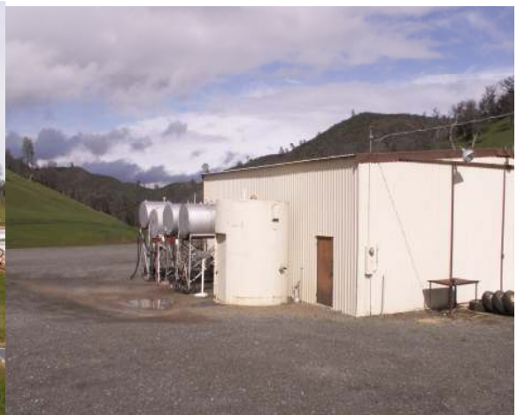
Shop and tanks