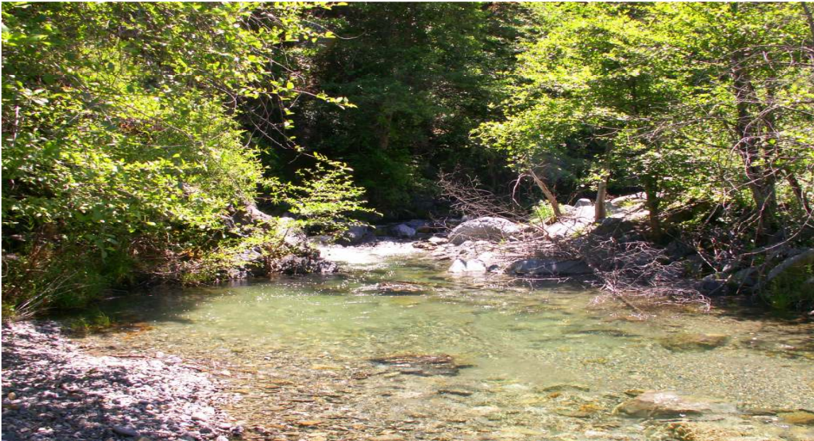
Year round Briscoe Creek, May 2010

Water is gold and this ranch has lots of it. The seven ponds provide water year round and sustains great wildlife habitat. Green Valley creek is seasonal, but has good water flow in the winter time and runs for almost 5 miles. There is also a year round creek with over 3000' ft frontage on both sides, known as Briscoe creek, that will keep the fisherman happy. The headquarters home is fed from a well and provides plenty of water for the house and landscape. The other modular home is fed from its own well.