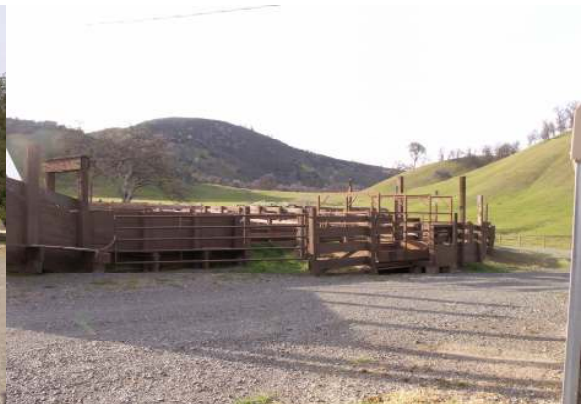
Corrals looking west