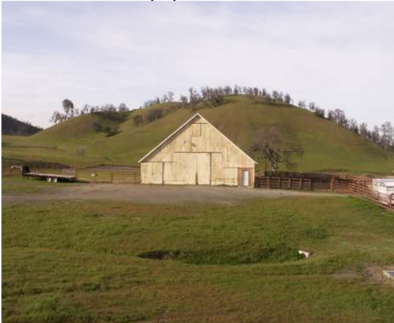
View of barn

This 1500 sq ft 3 bedrooms, 2 baths home is nicely cared for and move in ready condition. The headquarters has a great barn, shop, guest cottage and caretaker home. The grounds are well maintained, fenced and with lots of room for vehicles and equipment.