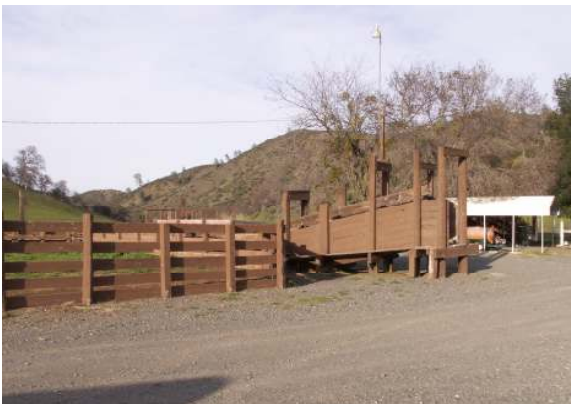
Corrals looking east