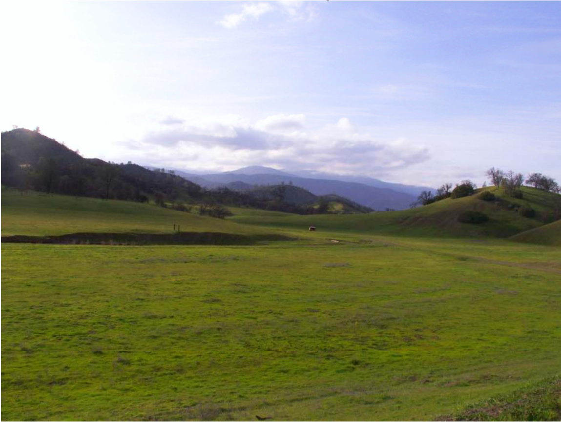
Looking north up Green Valley, March 2011

A detailed description of the APN #'s and zoning classifications is available upon request. About half of the ranch is in the Williamson Act. The taxes for the ranch last year were about $21,059 a year.