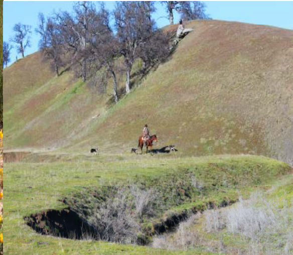
Looking for cows