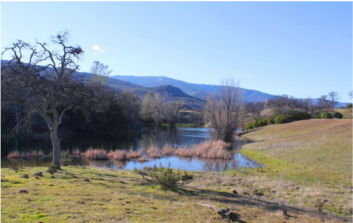
One of the hidden ponds looking at Witches Hill (on ranch)