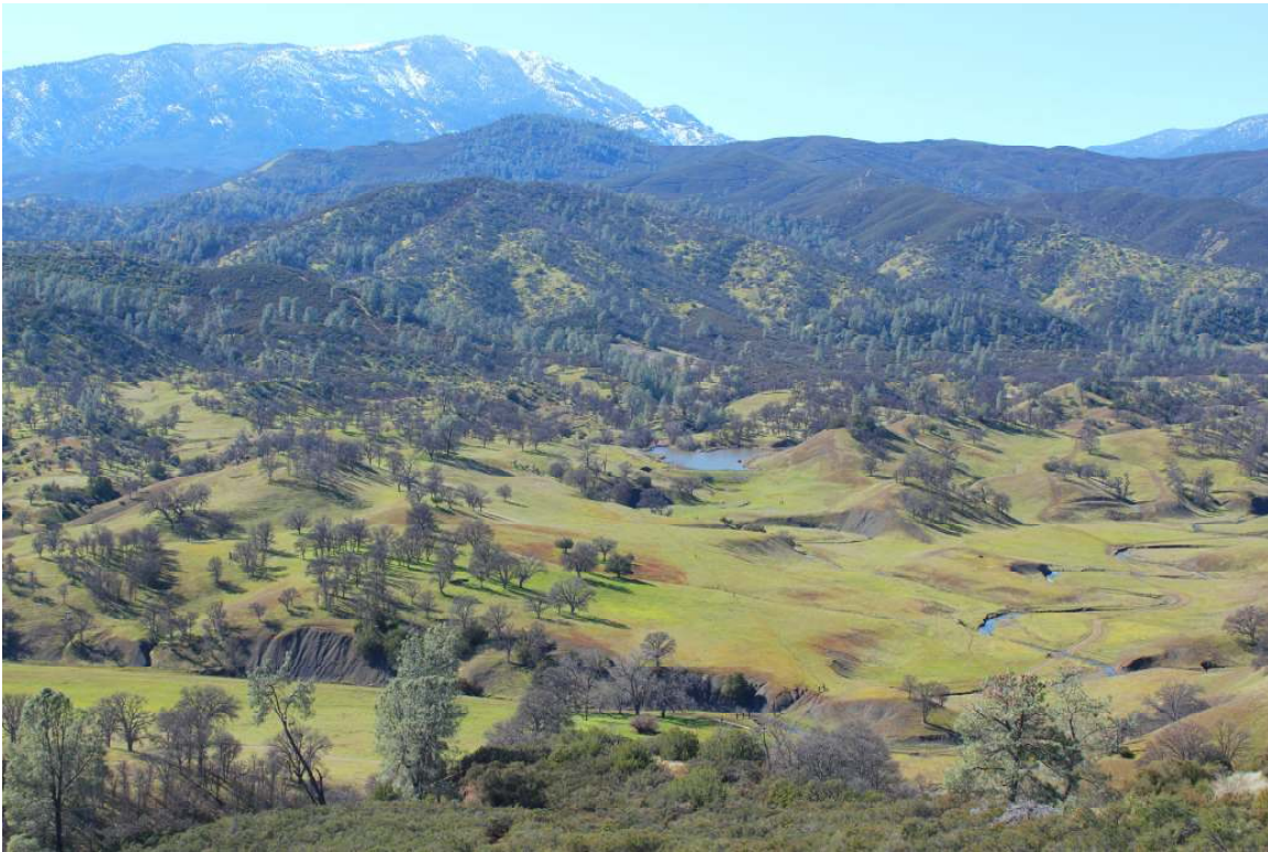
Beautiful Valley with Snow Mountain in the backdrop, Feb 2011