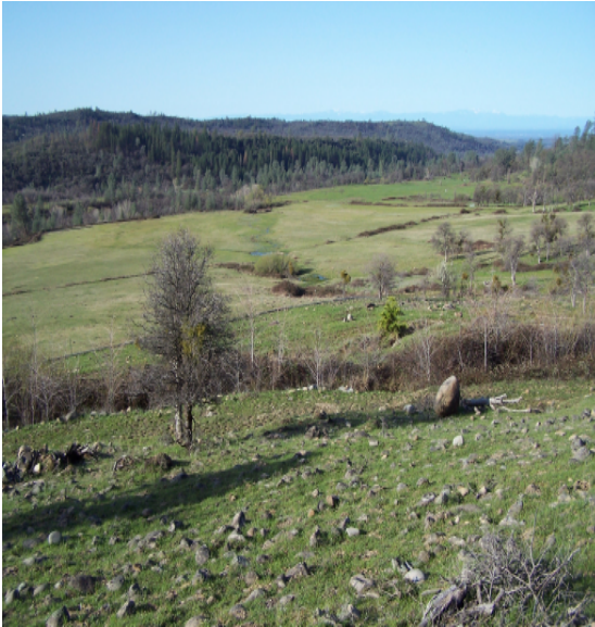
Pasture in winter