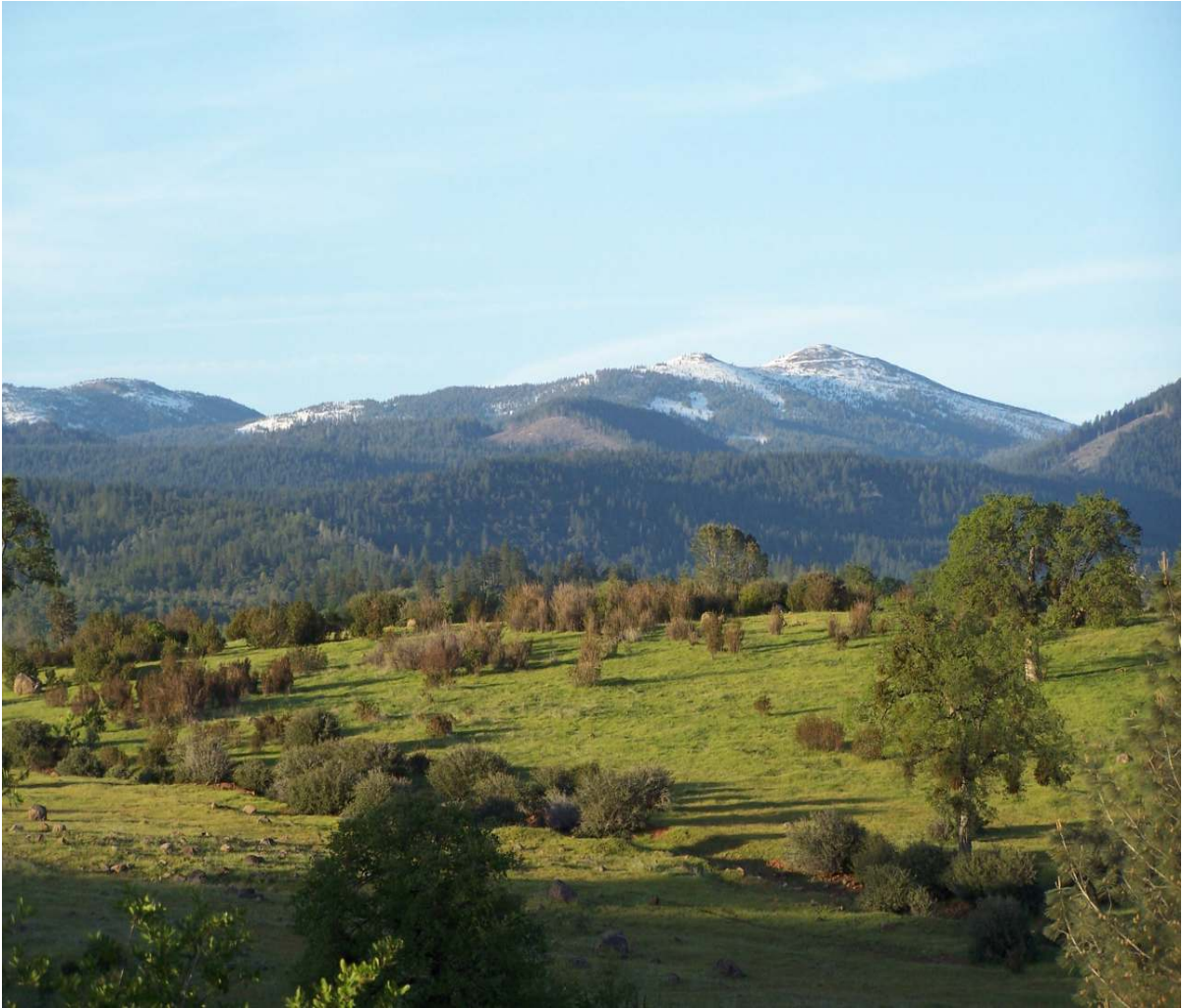
View of surrounding mountains

The ranch consists of four parcels APN# 099-020-063 (216 acres), APN# 099-020-064 (80 acres), APN# 099-360-086 (130.44 acres), and APN# 099-020-057 (40 acres), for a total of 466.5 acres. The property is zoned Habitat protection and is not in the Williamson act.