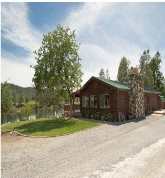
Back of Lodge