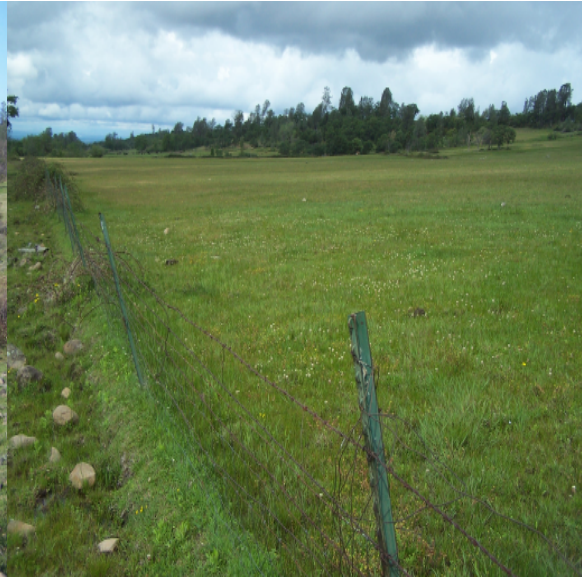
Pasture in spring