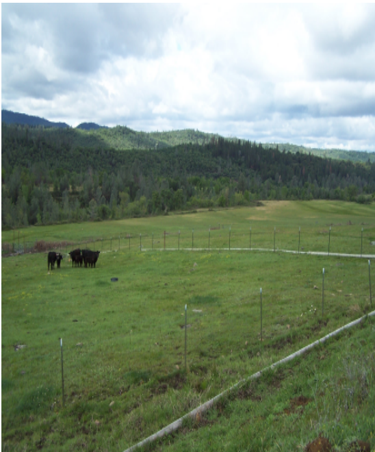
Cows on pasture