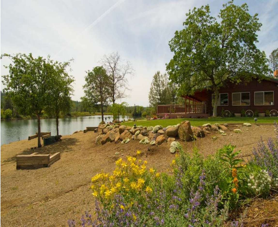
Lodge and horse shoe pit

This 466 +/- acre property is located in Shasta County about 25 miles from the town of Redding, CA and 14 miles from Millville, CA. Redding is a town with over 80,000 people and has all the major box stores, hospitals and airport. California's state capital Sacramento is 190 miles away. Take Highway 44 out of Redding and head east toward Lassen Park. Go 11.1 miles and turn left on Old 44 Drive. Go about .8 miles and turn right on Whitmore Rd. Then go about 11.3 miles and turn left on Fern Rd. In 2.9 miles you will arrive at 12347 Fern Rd. There is a locked gate and appointments will be needed to view the ranch. This ranch has it all. A beautiful 3380 sq ft home with 4 bedrooms and 3 bathrooms, a 2000 sq ft ranch house, 600 sq ft guest house, lodge and four-plex behind the lodge, 3000 sq ft new metal shop, an 8 acre pond, and 110 acres of irrigated ground. Ranching, hunting, fishing, horseback riding, family compound, retreat center, dude ranch... the list can go on and on.