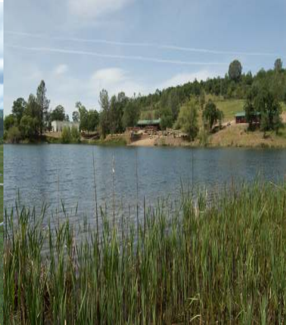
Shop, lodge four-plex

The list of structures is endless. A 3000 sq ft new metal shop has concrete floor, 3 automatic roll up doors at 14 ft high with openings of 10'ft, 12'ft, and 14'ft. The 1440 sq ft lodge has a nice big fireplace and is currently used for weddings, parties and banquets. They also have a 4 unit guest quarters out the back. The 2000 sq ft ranch house with 3 bedrooms and 2 bathrooms is currently rented out for $600 a month. There is also a one bedroom guest house, a barn, tack building, corrals, and several outbuildings.