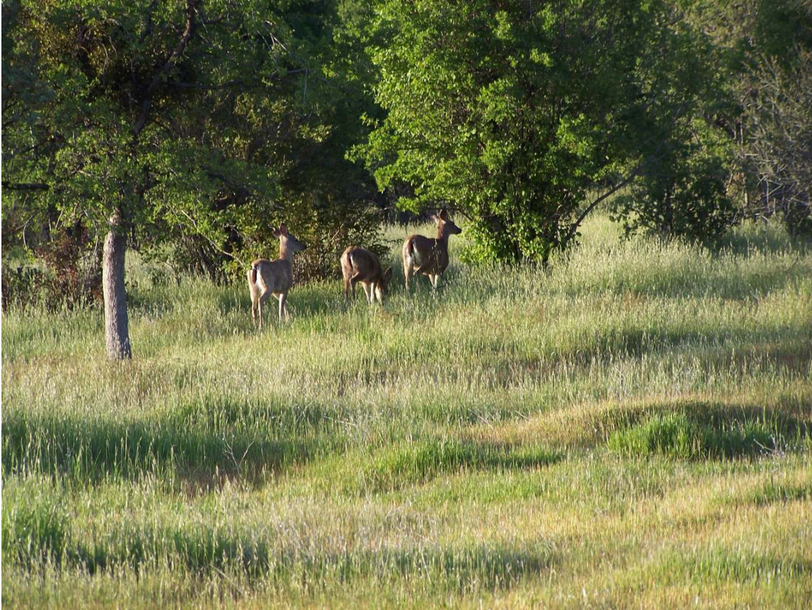
Three deer in spring

The property is definitely in a recreational wonderland. The 8 acre pond provides for trophy bass fishing. The ditch water traversing the property provides for great habitat for game. The owner also shared that the property is quite the expressway for deer migrating from the Lassen area in the fall to the lower valley region. The owner has seen some nice bucks and even a few bears. The property is in the C3 hunting zone. The owner has recently taken down a wild boar and a big buck. You can always see covey's of quail and during the fall the doves come out. The turkey population continues to grow. Just minutes from the property are endless recreational activities. You can head east to Mt. Lassen and enjoy the beautiful Lassen National Forest and Mt. Lassen. You can head west and fish in the mighty Sacramento River for trout, salmon, and steelhead. Head north to Mt. Shasta and go snow skiing at Mt. Shasta Ski Park, go water skiing at Shasta Lake or fly fishing in the many streams, rivers and creeks. Redding provides plenty of shopping, restaurants, golf courses and you are just a 40 minute drive to town.