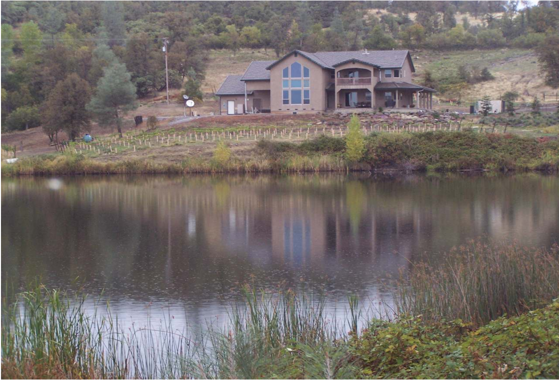
Back of house

No expense was spared in the 3380 sq ft English Tudor style 4 bedroom/3 baths home that was completed in 2005. Featured throughout the house is custom lighting to create whatever mood you like. Also featured is a whole house fan, whole house vacuum, bull-nosed corners throughout house, ceiling fans in every room and a \frac{3}{4} wrap around porch. On the first floor is the kitchen, dining room, great room, bar, laundry room, office/bedroom, and full bath. The kitchen has beautiful granite countertops, oak wood floors, Alder-stained Cherry cabinets with matching custom-paneled refrigerator, Jenn-Air stove, Whirlpool trash compactor, Bosch dishwasher, microwave, and Dacor oven, and prep sink in island. There is a walk-in pantry and built-in desk area. Enjoy peaceful views from the kitchen overlooking the vineyard and pond. The kitchen opens into the Great Room. The Great Room features a beautiful stone propane gas fireplace and views of the vineyard and pond. Opening into the Great Room is your own private bar, equipped with mini refrigerator, dishwasher, sink and kegerator. Built-in surround sound in the Great Room is a great entertaining addition. The 16ft high walls open up to a two story cathedral ceiling with overlook from the upstairs. The 22ft high picture windows have their own remote control blinds. French doors