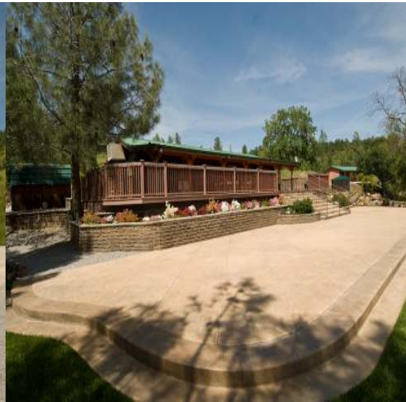
Front of Lodge