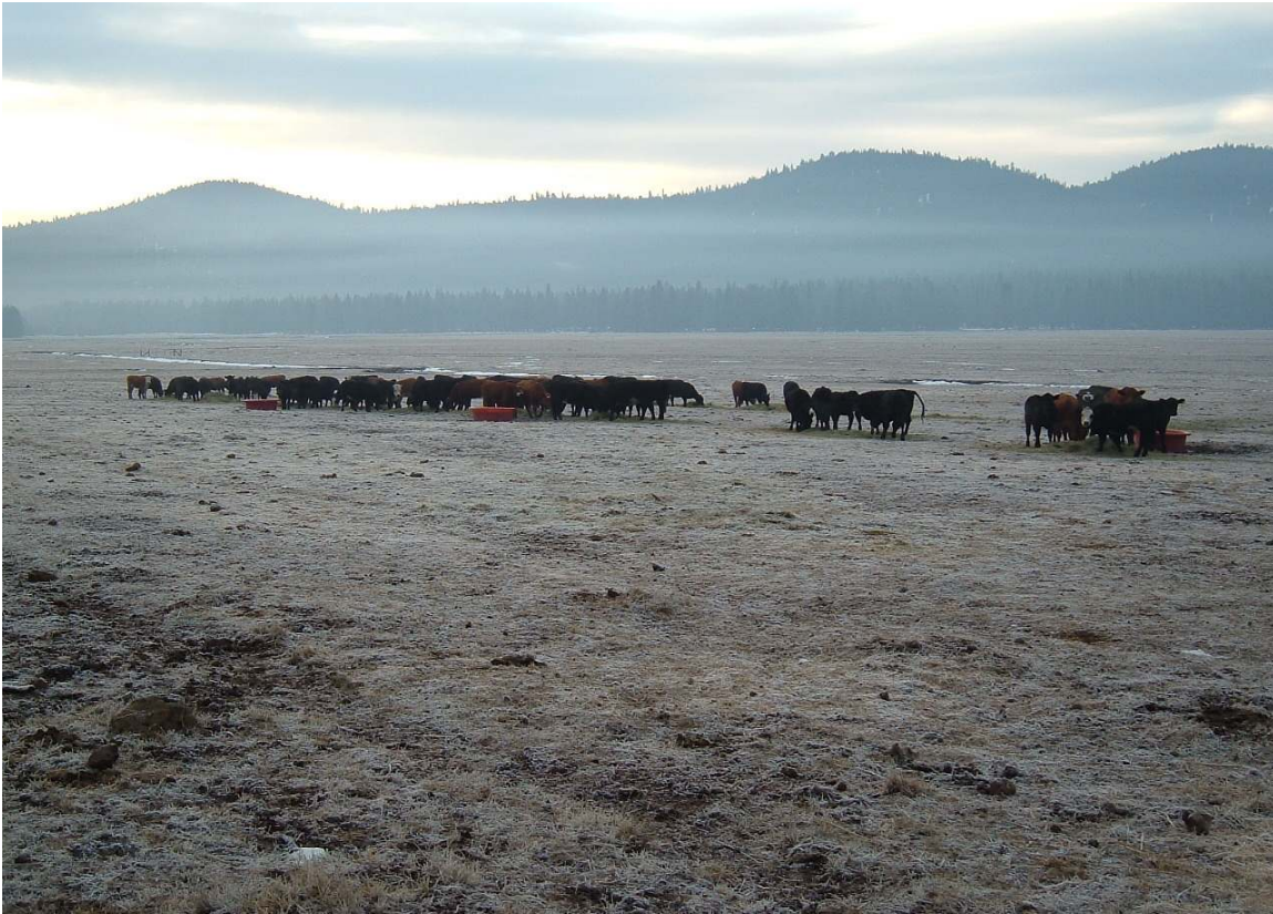
Feeding cows early morning