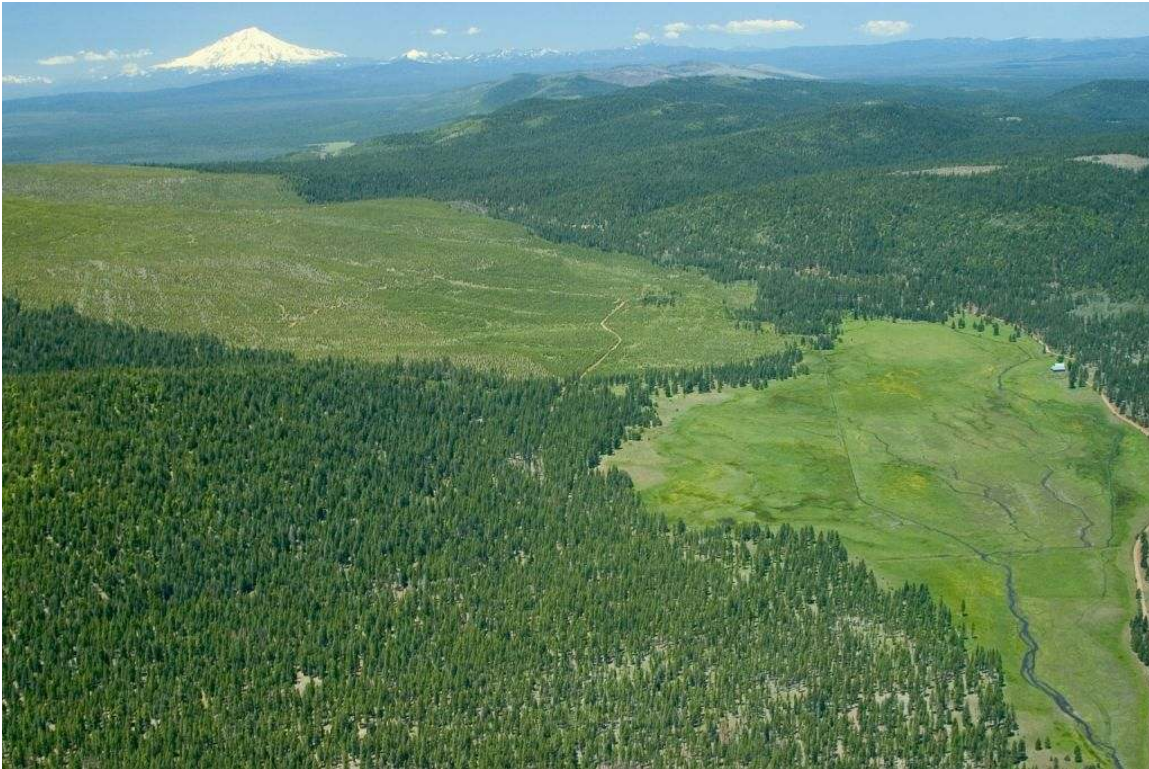
Nice aerial view of part of the ranch and barn

The property consists of 5 parcels for a total of 883 acres. The property is zoned unclassified agricultural use and is not in the Williamson act. The property sits at the 4260 ft elevation and rises to 4400 feet in the forest portion of the property. The property is mostly flat with some rolling hills along the outer edge. Two big beautiful meadows are surrounded by pine tree forest. The county road is a year round gravel road that goes by the barn and homestead. The ranch borders Modoc National Forest on the eastern border and Sierra Pacific timber company on the Southern end. To the north and west you are mostly surrounded by W.M. Beaty & Associates timber ground.