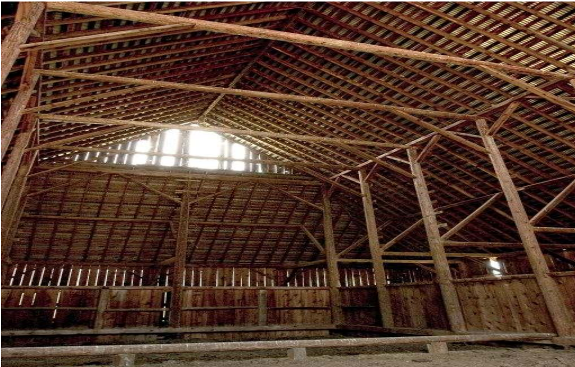
Inside the turn of the century barn

The turn of the century 6000 sq ft barn has been nicely restored. There is a nice big heated tack room, storage area and new cement for the support corners and new metal roof.