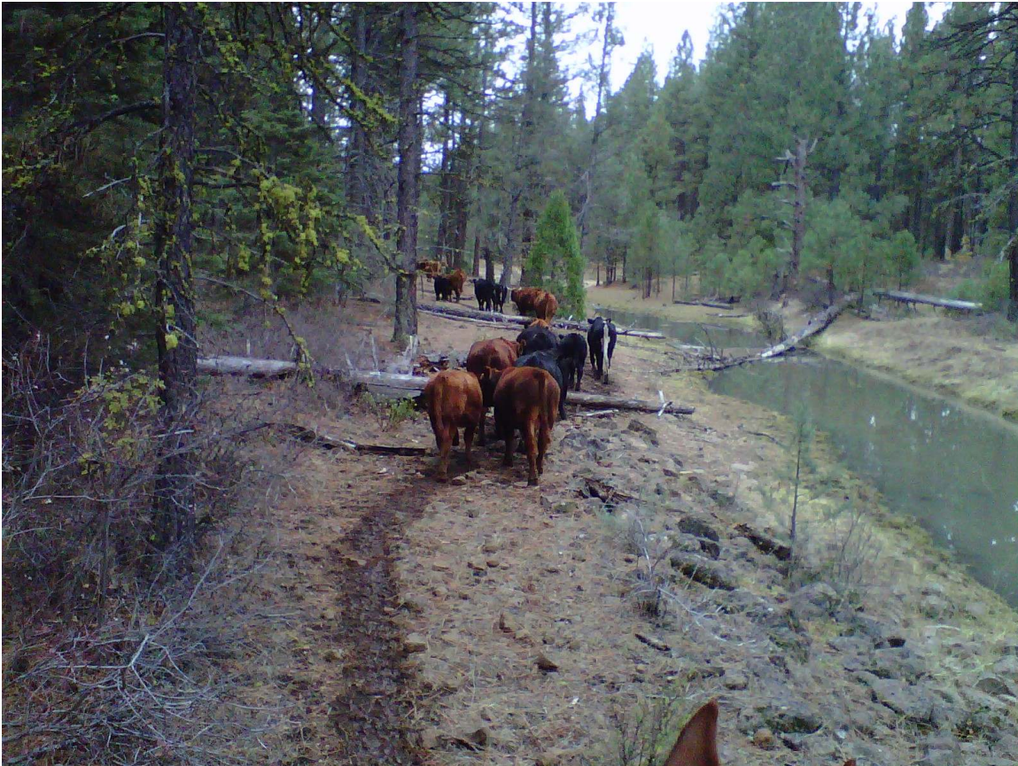
Driving the cows up Widow Creek in the Fall

The ranch has adjudicated water rights to Widow Valley Creek per the Pit River Decree No. 6395 February 17, 1959. The water right is for 400.50 acres and 5.72 cfs from the creek. The owner installed a new pump and panel for an irrigation well that produces 2500 GPM from an electric pump. The costs have been $ to run the well for the summer. The owner has also put in a new electric motor and pump for the windmill well that feeds consistent stock water. The house gets its water from a house well that produces approximately 10 GPM. The owner has also improved the irrigation structures for the meadows. The 400 + acres of meadows are irrigated and sub-irrigated. The meadows are fenced and cross fenced. The remaining deeded ground is timberlands with approximately 2.5 million board feet of timber. The ranch was last logged in 2000 and they did a good job chipping and thinning out the left over trees.