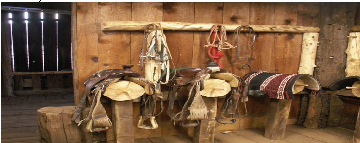
Tack room in the barn

Adjoining the 883 acres is approximately 25,000 acres of private grazing permit ground that the ranch has been leasing. The permit ground is used to graze cattle from mid-May through October depending on the season. The permit capacity is approximately 1435 AUM's. The deeded ground can run 1200 AUM's and that give the ranch approximately 440 cow/calf pairs for the season. For more information on the permit ground, please contact the office for maps and more details. The deeded irrigated meadows are fenced and cross fenced. With the adjudicated water rights to Widow Creek and the new agricultural well, the 400 irrigated acres have been improved and upgraded. This is a great summer cattle ranch with its cool evenings and warm days make for a nice break from the hot valley floor.