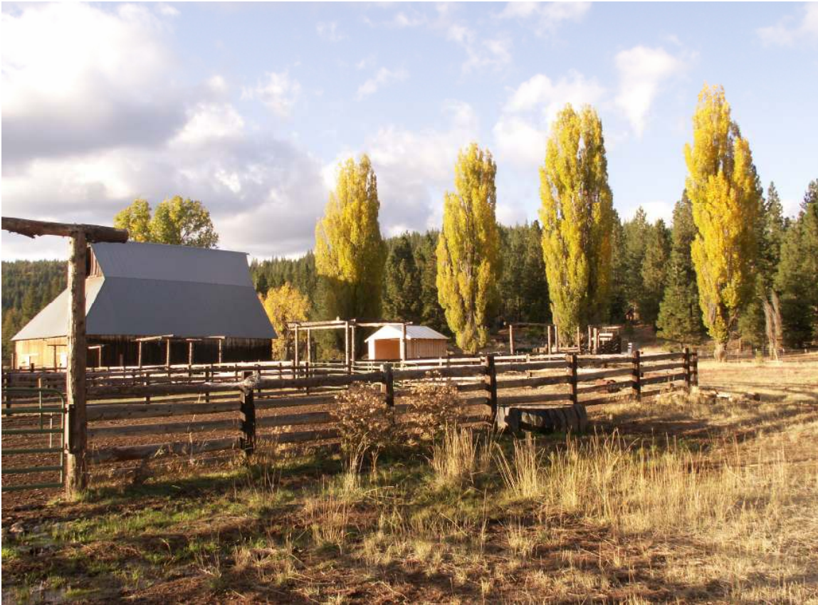
Barn in the Fall

This 883 acre property is located in Northeastern California in Modoc County. The ranch is in the Big Valley area where the counties of Lassen, Shasta, Siskiyou and Modoc meet. The Valley has four little towns; Adin, Lookout, Bieber and Nubieber. These little towns have your basic necessities. The ranch is about 5 miles from the town of Lookout, 7 miles from Beiber, 9 miles from Nubieber and 17 miles from Adin. The closest hospital and good airport would be Fall River Mills, CA which is 30 miles away. Fall River Mills has recently upgraded their airport to a 5000 ft. runway. Fall River Mills is famous for world class fly fishing and has a nice 18 hole golf course. For your serious shopping needs, Redding, CA has most of the big retailers and is 100 miles away. Redding would also be the closest commercial airport. The ranch has year round access and is off a county maintained road. From the Bay Area, head North on Highway 5 and at Redding take Highway 299 East and go through the towns of Burney and Fall River Mills. Stay on Highway 299 and you will drive into the Big Valley and drive through the towns of Nubieber and Bieber. As you pass Bieber make a left on Bieber Lookout road and follow the road for 3.8 miles, make left and drive into Lookout. Stay on Main Street and you will run into County road 93. Make a right and follow the road for a few miles and make a left on a gravel road labeled Widow Valley Rd and follow the road to the ranch.