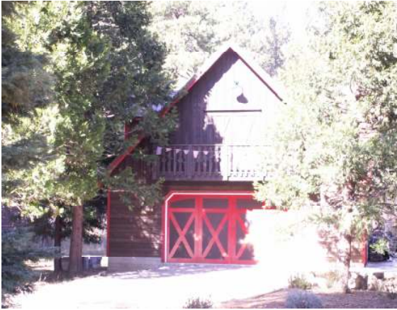
Looking north at front of Carriage House