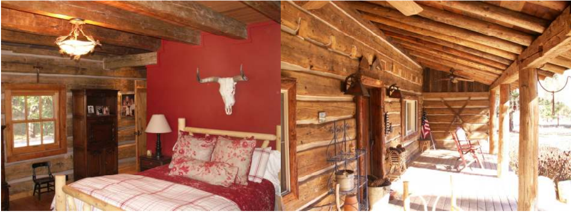
Kitchen, Master bathroom, master bedroom, front porch