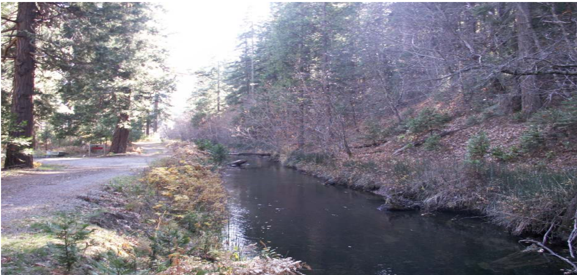
Diversion canal along road

The property fronts Indian Creek. Indian Creek is year round and has great trout fishing. Imagine fly-fishing just outside your front door. In the summer time, a diversion dam is built for irrigation in the valley and a small lake is formed. This is what is pictured above. A portion of the water is diverted by means of a canal that runs along the road of the property. This canal has the look and feel of a second river on your property. (Please see the photo below.) The house is serviced by a well approximately 80 feet deep and has a strong 30 gpm.