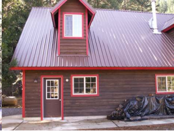
Front door of Carriage House looking west