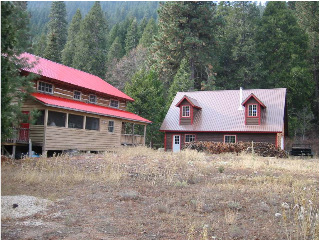
Looking west at Carriage House and back sitting room

The carriage house measures 2100 sq feet and has a nice, big garage downstairs with a work bench and wood stove. The upstairs is unfinished, but insulated with dormers. It would make a great game room or quest facilities.