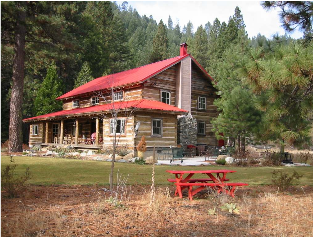
Log cabin looking west

The house was built in 2004 and has the look of a rugged log mountain cabin, but has all the conveniences of the 20 th century. The hand-hewn log cabin was designed by the owner. The logs were taken from a mining barrack in Canada and shipped to Taylorsville. This is not a prefabricated log cabin home. This is a piece of art. The five bedrooms, three full baths, office, den and open gourmet kitchen make up the 3100 sq feet. The log cabin is meticulously decorated and the owner is willing to sell most of the furnishings with the property. In 1997, Indian Creek got higher than its banks and flooded a portion of the property. The owner was very proactive and did not want to worry about another flood and moved earth so the log cabin would be above the flood plain. The cabins foundation sits five feet above the flood plain.