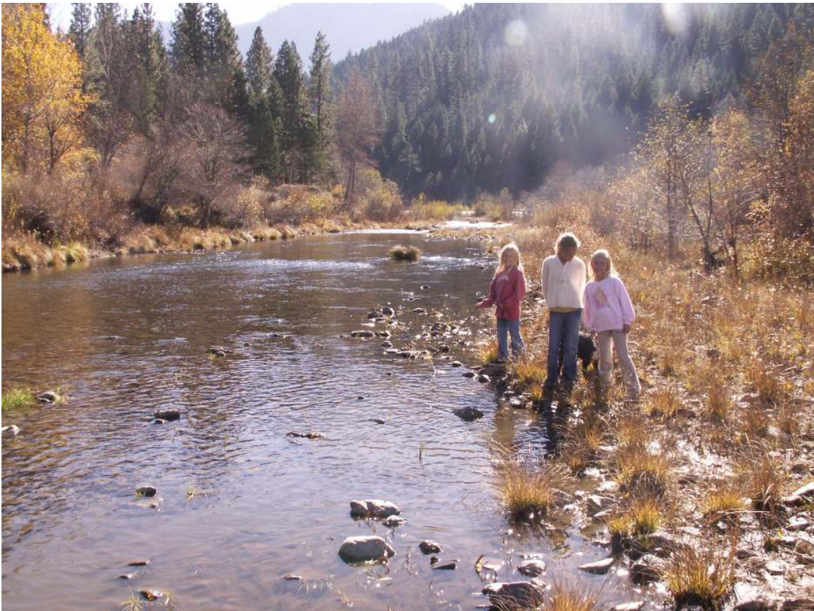
Indian Creek in Early November

The property is a recreational wonderland. There are incredible opportunities for fishing, hunting, and horseback riding. The pine trees are home to deer, bear, fox, and a plentitude of birds, including bald eagles, golden eagles and herons. The Mount Hough State Game refuge is near the property. The property is located in the X6A zone. The X6A zone was ranked 7 th in the state for bucks with four points. Plumas County ranks among the top five in the state for annual bear