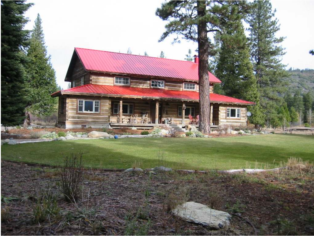
House looking North

This 21.79 +/- acre property is located in Plumas County in the town of Taylorsville. Taylorsville is a small country town with a population of 160 people. It is known for its annual rodeo, fishing, biking and beautiful views. Eleven miles away is the town of Greenville with over 1000 people, a local high school, Indian Valley Heliport and the historic downtown. Reno is just 103 miles away, Sacramento 145 miles and San Francisco 228 miles. In two hours, you can be at the Reno International airport, or if you have your own plane, fly into Quincy at 21 miles away. Hospitals can be found in Quincy and Chester (35 miles). Lake Almanor, the next "Lake Tahoe", is only 33 miles away and if you want to go to Lake Tahoe, it is only a two hour drive. From the Bay Area, take Highway 5 North, turn on to CA-99 Yuba City/Marysville, go North, turn on to CA-70, continue North, take CA-89 to Greenville, turn right on CR-A22 Arlington Road and go about five miles and make a right on Mill Race Road. This private estate has to be seen to be appreciated. A unique property with a beautiful 3100 sq ft log cabin home, carriage house, frontage on Indian Creek, surrounded by Forest service land and endless views of tall pines, meadows and towering sierra mountains.