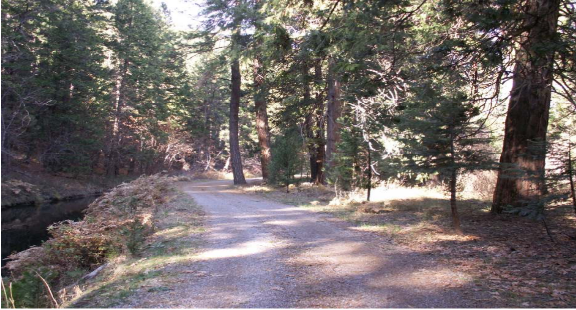
Mill Race Road

The property consists of one parcel APN# 120-120-31 ▪ (21.79 acres). The property is zoned REC-OS, SP-SCA, S-3, and FP. Zoning definitions and uses are available upon request. The property is located at the end of Mill Race road, a private gravel road with a total of four homes. This parcel is the last parcel of the group. The property is fairly flat around the home, meadow and creek. It gets steep across the diversion stream. The property fronts Indian Creek on its Eastern side. Forest Service ground on the South and West and the North borders the neighbors 20 acres. The gravel road is 6/10 of a mile and has a road maintenance agreement with the neighbors. Access to the property is year round. The elevation is 3500 ft. There are thousands of acres of National Forest Service ground that borders the property and provide endless recreational uses.