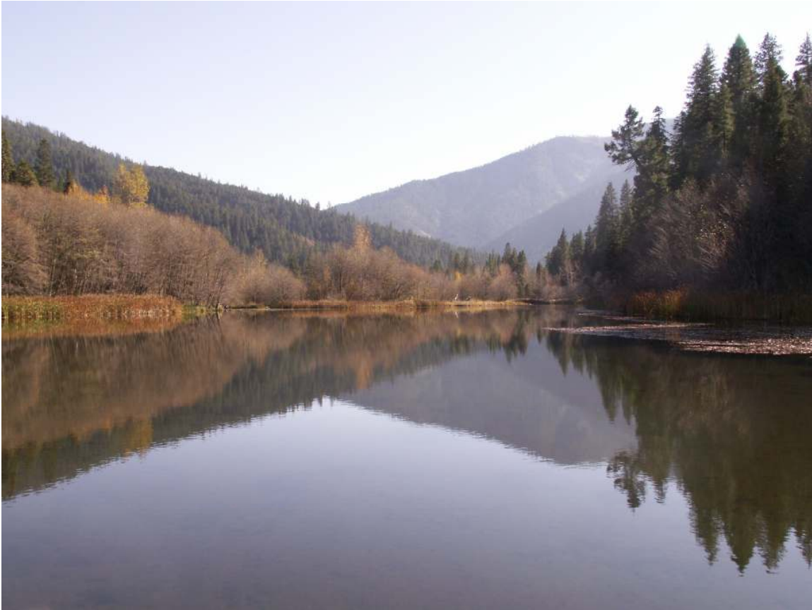
Indian Creek diversion Dam Lake

The property fronts Indian Creek. Indian Creek is year round and has great trout fishing. Imagine fly-fishing just outside your front door. In the summer time, a diversion dam is built for irrigation in the valley and a small lake is formed. This is what is pictured above. A portion of the water is diverted by means of a canal that runs along the road of the property. This canal has the look and feel of a second river on your property. (Please see the photo below.) The house is serviced by a well approximately 80 feet deep and has a strong 30 gpm.