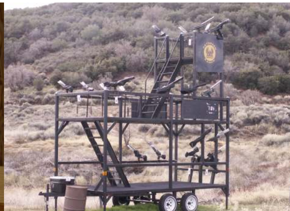
Five stand sporting clay course

The ranch can keep a hunter busy all year. As you drive around the ranch you will notice all the covey of quails and deer. There is plenty of predator hunting and tons of potential to improve habitat. If you have dogs, they will receive special attention in the heated indoor/outdoor dog kennel and facilities to raise game birds. Great dove hunting and the ponds attract waterfowl. The valley has its own unique flyway. Lake Elizabeth Golf and Country Club is just 3 miles from the ranch and has an 18 hole golf course, 6037 yards par 70, lined with century old Cottonwood trees, club house restaurant, lounge, pro shop, driving range, practice putting green, snack bar, olympic sized pool, restrooms, and dressing rooms.