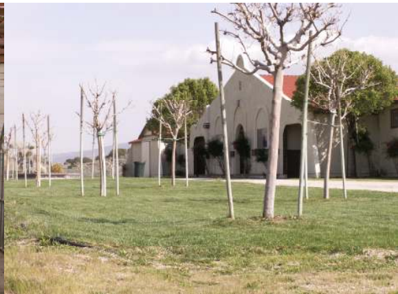
Outside the main barn