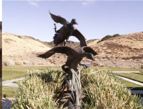
Nice bronze sculpture at the range