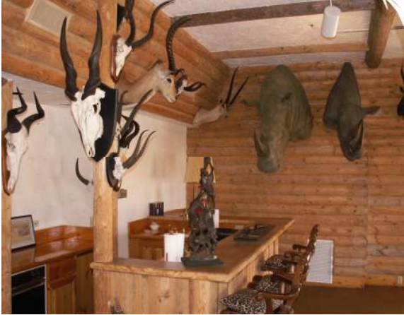
Basement east wall