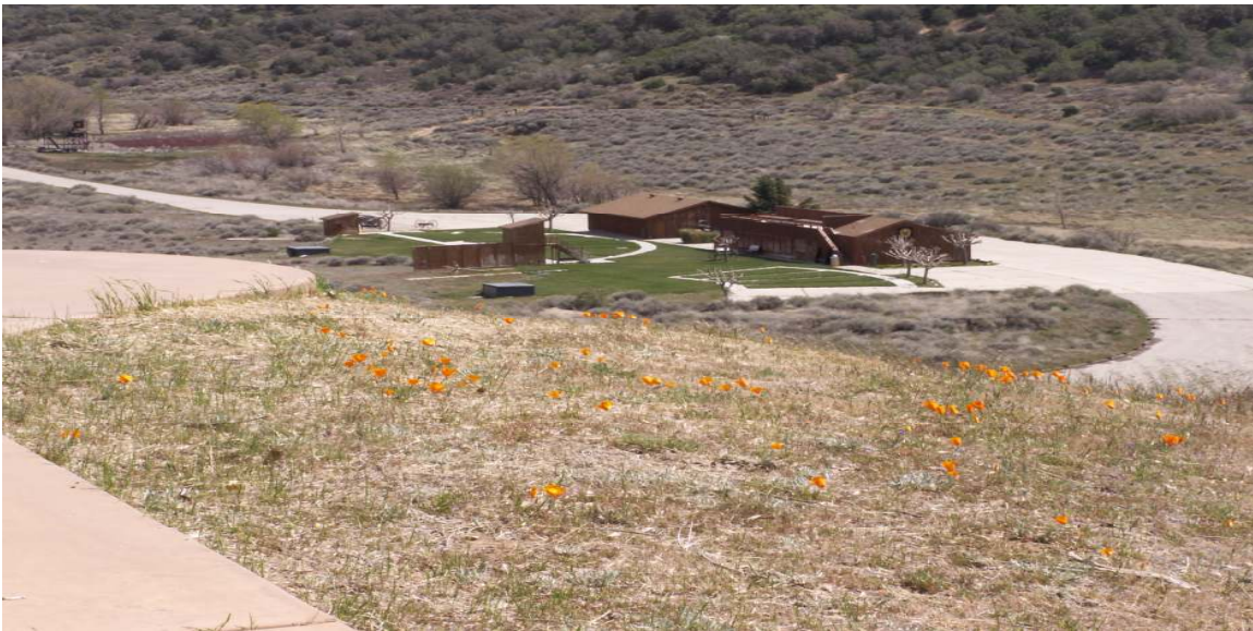
View from guest house of the Professional Skeet and Trap Facilities