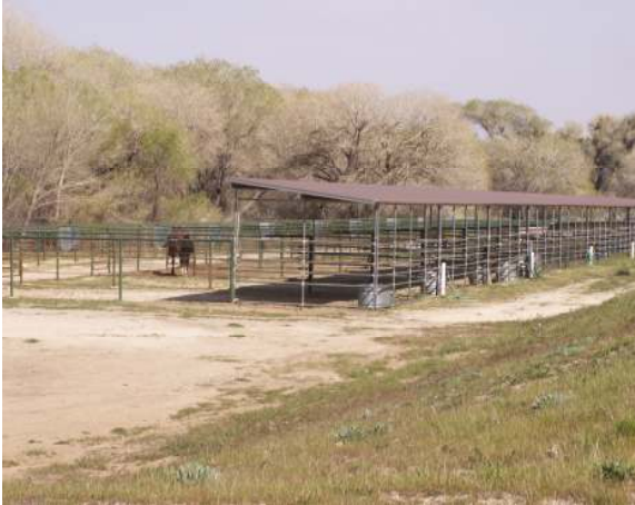
12 outdoor covered stalls