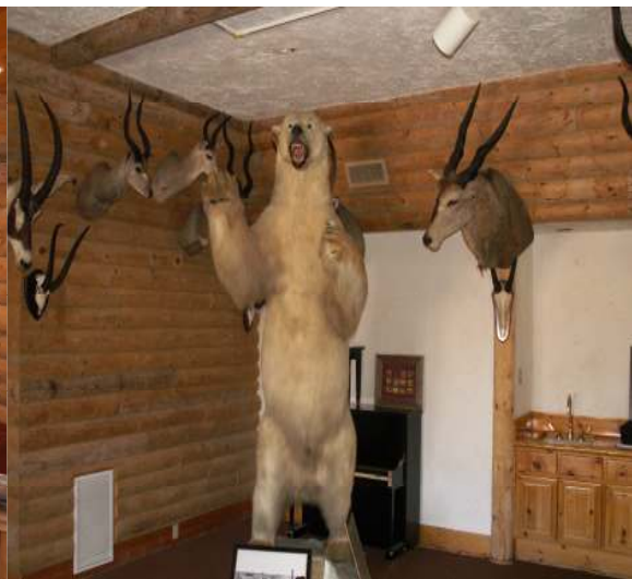
Basement north room