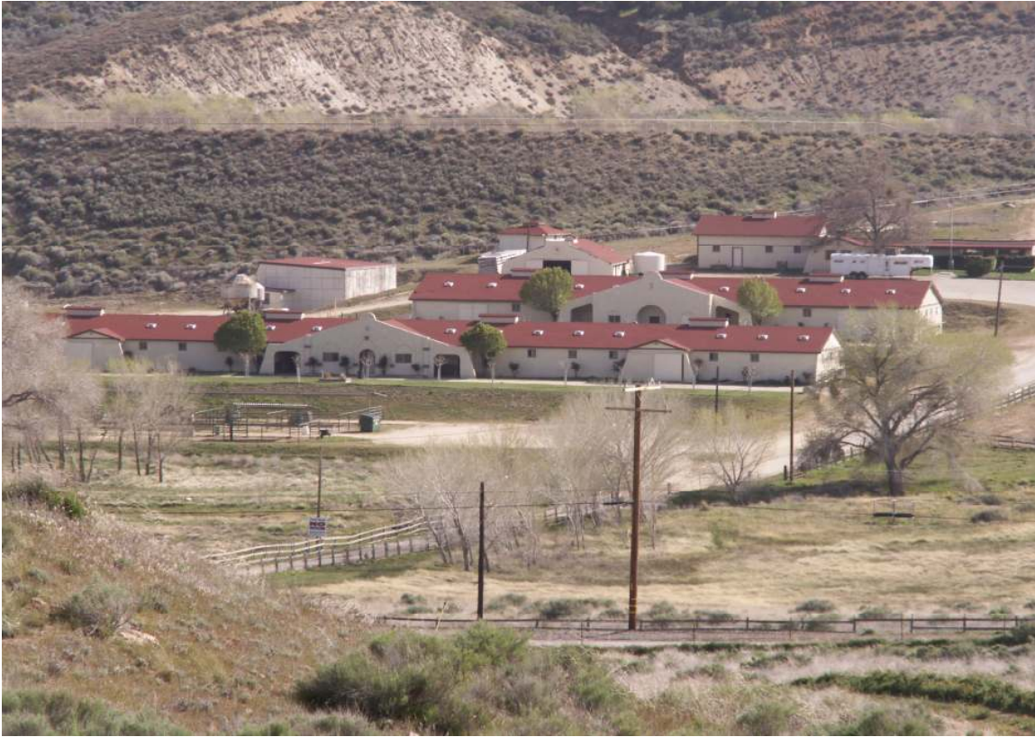
View looking south at equestrian center, 5/8 mile track on top