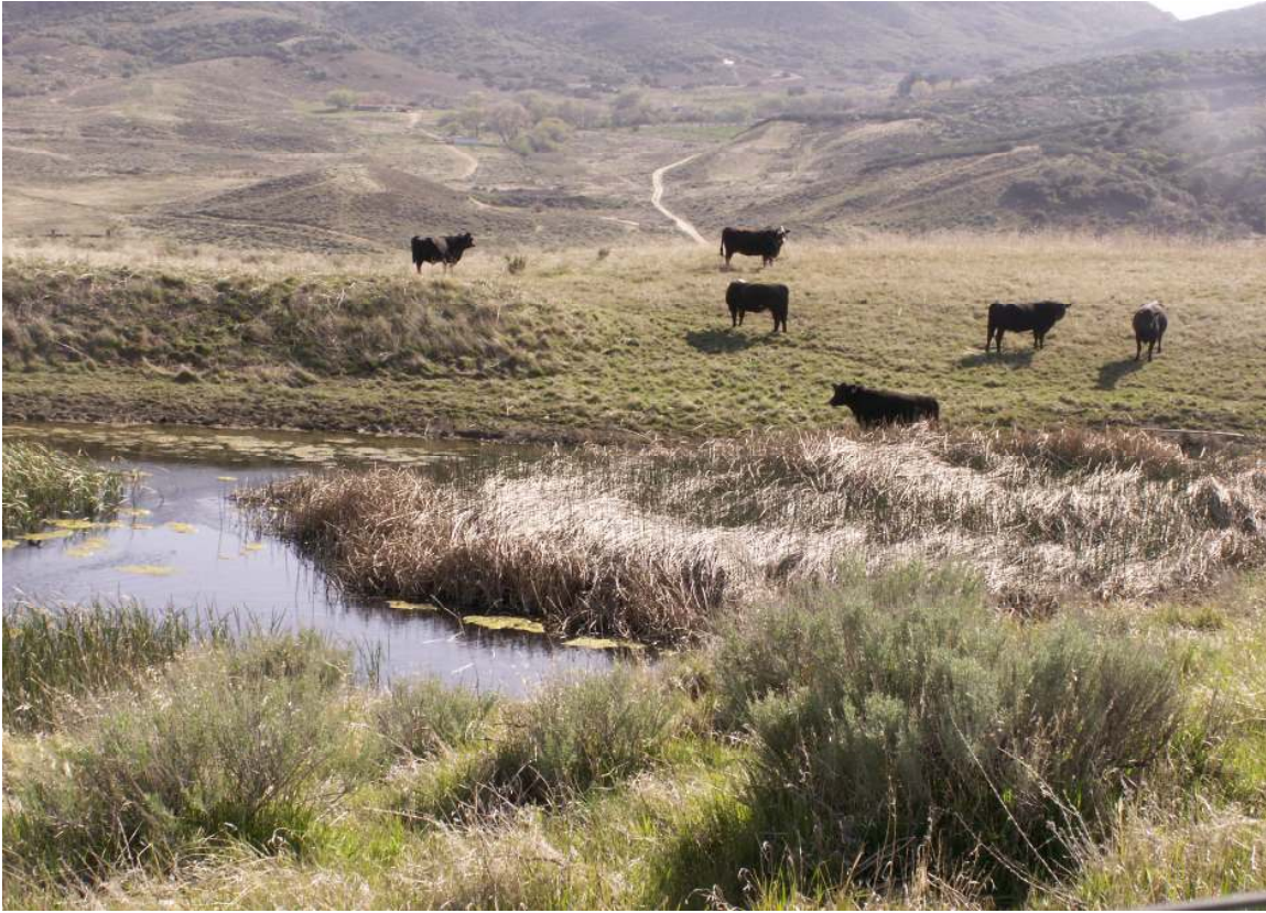
Cattle on the southeast part of the ranch