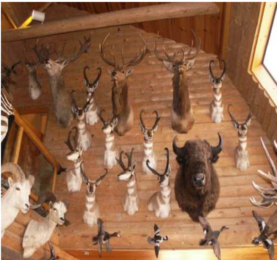
East wall of 1 st floor