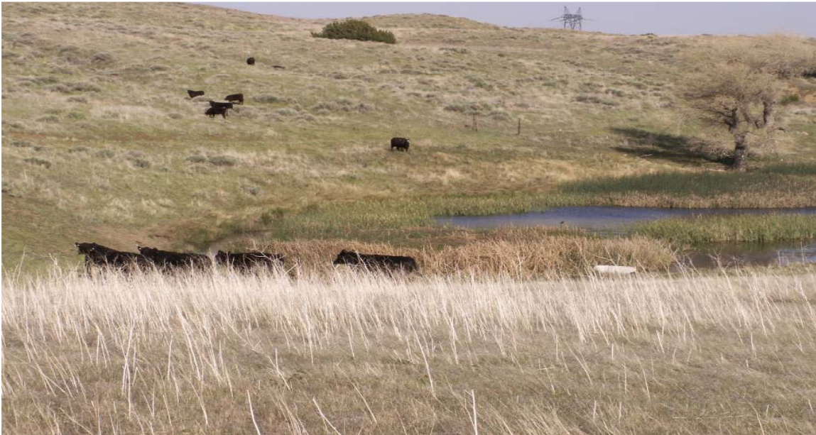
Cows checking out the grass in March at one of the ponds

This is one of the last working cattle ranches in Los Angeles County. It has been traditionally used as a summer grazing outfit with the cows arriving in mid April and shipped out in mid-October-November. The ranch can handle 200 pair and depending on the rain fall can handle more or less. The ranch is fenced and crossed fenced with good solid barbed wire. The corrals are located off of Lake Elizabeth road and have a loading chute, power and a well for water. The ranch is well watered with 6 ponds, several springs, and access to Lake Elizabeth water district for irrigation. The pastures are fertilizer and pesticide free making it a potential natural organic beef operation.