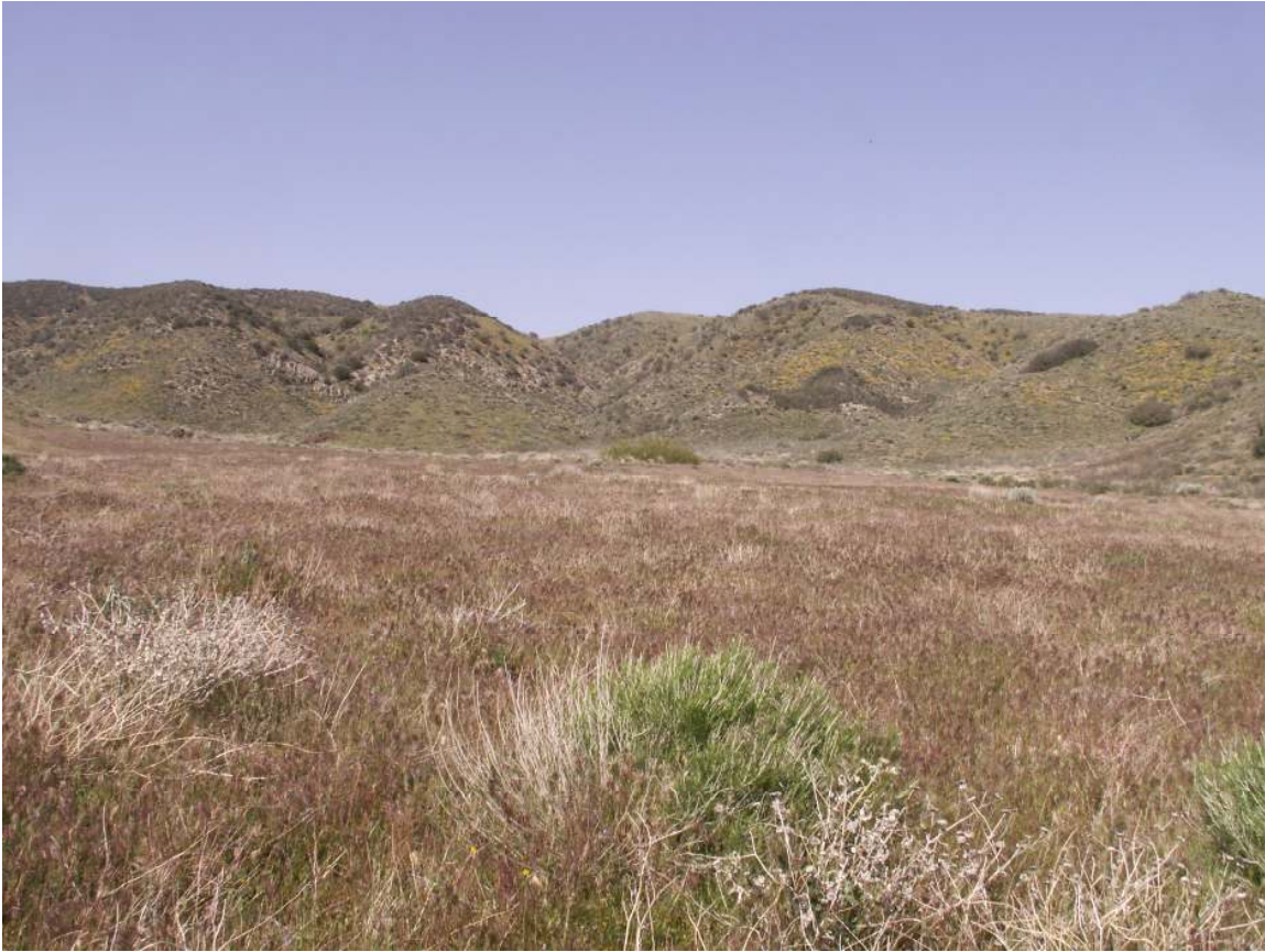
One of the many valleys looking north

The property consists of 95 parcels and is not in the Williamson act. A detailed description of these APN #'s and zoning classifications is available upon request.