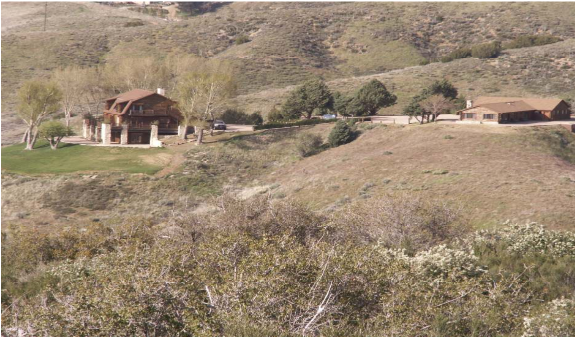
View of main log cabin and guest house

The guest house next to the main home is 2 bedroom and 2 full baths with nice views of the valley floor. It has a great entertaining patio with sliding glass door to the house. Five double windows provide great views to the outside. A 4-car garage, meat locker, and large paved parking area finish the outside. A special addition to the guest house is its own automatic skeet shooting house off the back large patio so guests can enjoy skeet shooting while relaxing or barbequing.