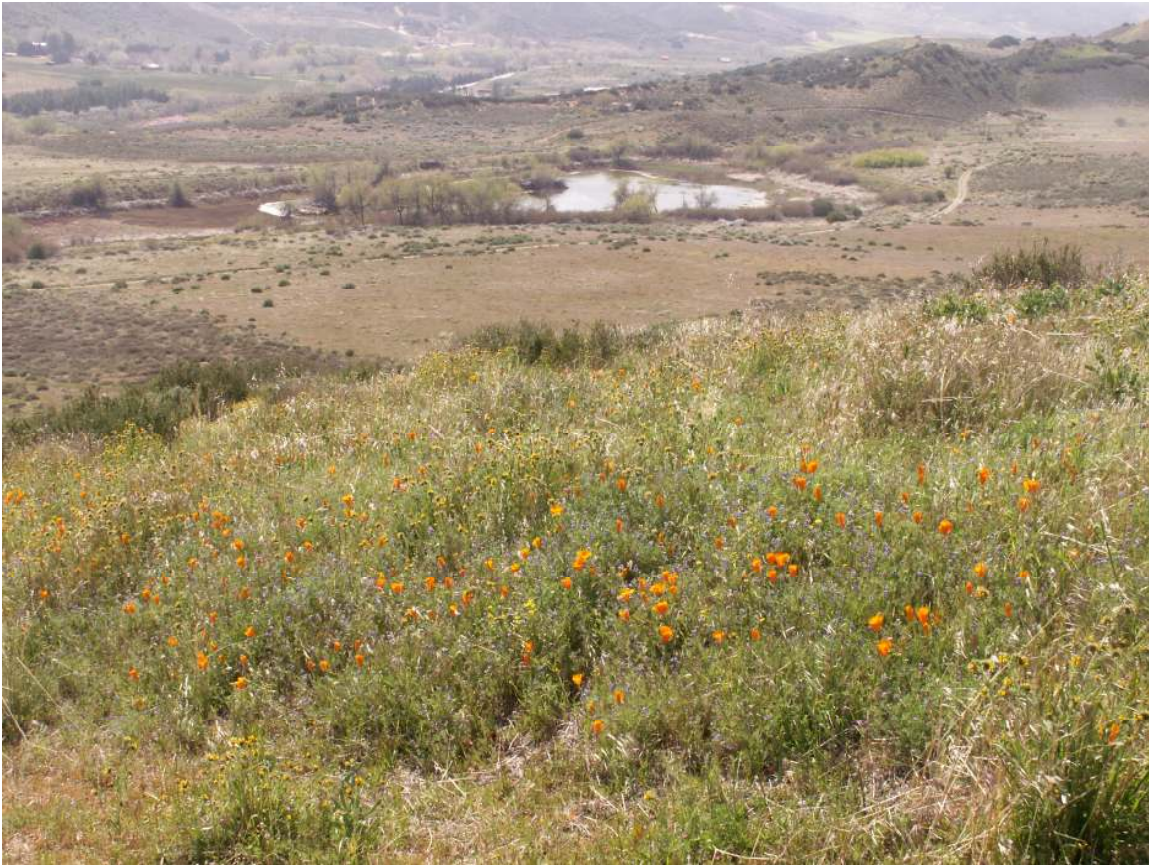
One of six ponds on the ranch looking south

Water is gold and this ranch has access to lots of it. The main home, guest house, caretaker homes, kennels and landscaping around the main home is handled by a well. The well feeds two 3000 gallon tanks and has not had any issues of running out of water. The equestrian center has two wells and only one well is currently in use and again is a good well with no issues. There is also a well near the cattle corrals which feeds a pond and water trough. The ranch has several springs and one of the springs has been developed into a water trough for the cattle. The real bonus for this ranch is the access to the Lake Elizabeth Mutual Water Company. The owners had the foresight to join the district and installed an 8 inch pipeline to a majority of its valley floor. The water can be used for irrigation, refilling ponds and enhancing the wildlife habitat. The water district can provide treated water or raw water from the California aqueduct. They get the raw water at about $235 an acre ft and the district adds a 20% fee to send the water to the ranch. The owners would often use the water from May until August and spend about $3500 to $4000 a month to keep the ponds full. The property receives its power from Edison and has a lot of interest from wind and solar companies looking to lease the land. The property has 8 working septic systems and all are in working order.