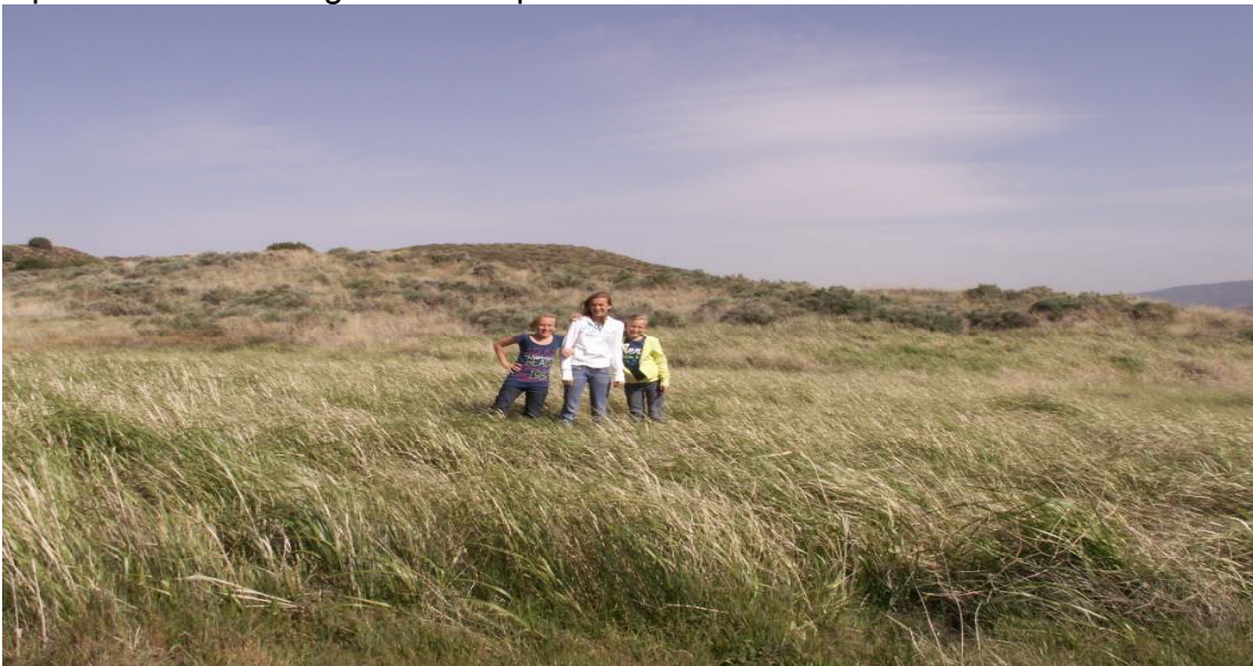
There is lots of grass for your cows. April 3, 2010

This is one of the last working cattle ranches in Los Angeles County. It has been traditionally used as a summer grazing outfit with the cows arriving in mid April and shipped out in mid-October-November. The ranch can handle 200 pair and depending on the rain fall can handle more or less. The ranch is fenced and crossed fenced with good solid barbed wire. The corrals are located off of Lake Elizabeth road and have a loading chute, power and a well for water. The ranch is well watered with 6 ponds, several springs, and access to Lake Elizabeth water district for irrigation. The pastures are fertilizer and pesticide free making it a potential natural organic beef operation.