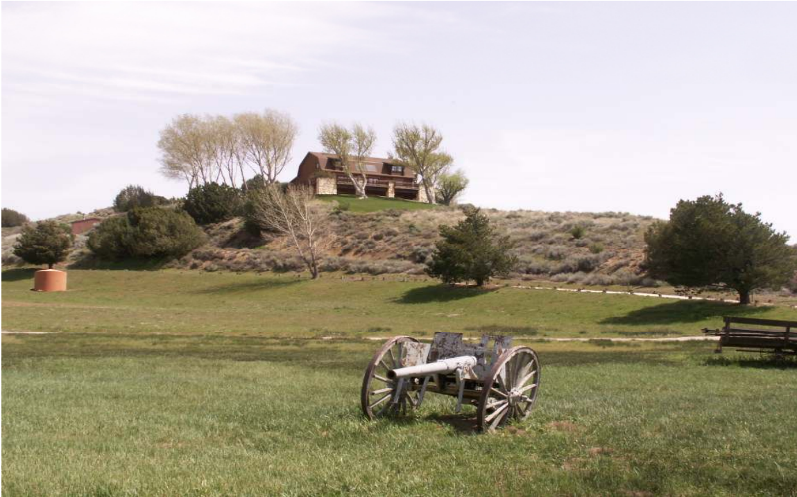
View of main log cabin looking northeast

The 5000 sq ft log cabin home has 2 bedrooms and 4 bathrooms and is set up to entertain. There are beautiful hardwood floors throughout the house. The big kitchen is set up nicely for entertaining with an 8 ft island with sink and cook top, Wolf gas range, Wolf grill, double ovens, walk-in pantry, and bar seating. The kitchen opens into a Great room with a large, welcoming fireplace and pool room. French doors are perfectly placed throughout the first floor that open onto a large deck overlooking the ranch. The second floor has two bedrooms, each with their own bathroom and jacuzzi tub. The second floor balcony separates the bedrooms and has its own fireplace with sitting area that overlooks the happenings on the first floor. The basement “trophy room” is perfect for entertaining large crowds with custom fully equipped bar, fireplace, two full baths, 6 French doors to outside patio, tons of storage space and hidden vault room.