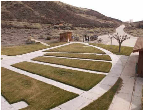
View of the Skeet stations

This is a recreational dream property. The five station trap range and 9 station skeet facilities are beautiful and with paved access and conference facilities it is a year round endeavor. The owners have entertained many clients and put on many competitions on the range. The conference center has room for 60 guests with a full bar, speaking podium, wood burning stove, men and women toilets and three large windows looking out on the range. There is also seating on the top deck for a nice outdoor viewing of the competition. A four car garage and storage building is also adjacent to the range and an outdoor large, top notch, double barbeque can handle all the grilling for a large party.