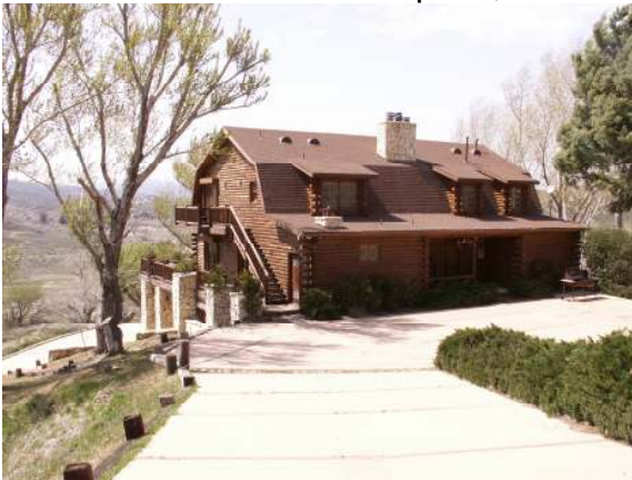
Back of main house

The 5000 sq ft log cabin home has 2 bedrooms and 4 bathrooms and is set up to entertain. There are beautiful hardwood floors throughout the house. The big kitchen is set up nicely for entertaining with an 8 ft island with sink and cook top, Wolf gas range, Wolf grill, double ovens, walk-in pantry, and bar seating. The kitchen opens into a Great room with a large, welcoming fireplace and pool room. French doors are perfectly placed throughout the first floor that open onto a large deck overlooking the ranch. The second floor has two bedrooms, each with their own bathroom and jacuzzi tub. The second floor balcony separates the bedrooms and has its own fireplace with sitting area that overlooks the happenings on the first floor. The basement “trophy room” is perfect for entertaining large crowds with custom fully equipped bar, fireplace, two full baths, 6 French doors to outside patio, tons of storage space and hidden vault room.