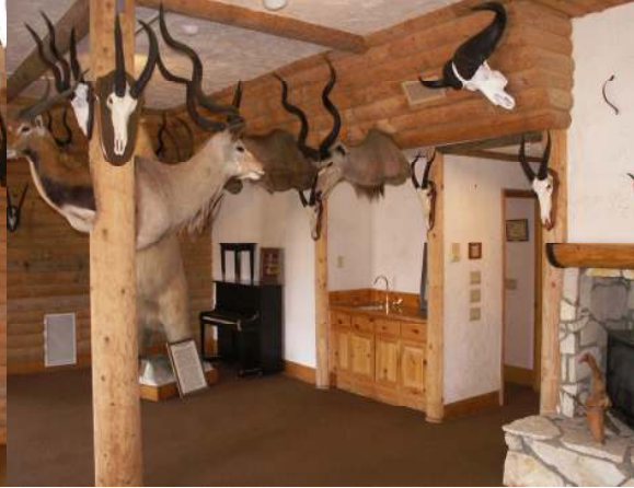
Basement north wall

The guest house next to the main home is 2 bedroom and 2 full baths with nice views of the valley floor. It has a great entertaining patio with sliding glass door to the house. Five double windows provide great views to the outside. A 4-car garage, meat locker, and large paved parking area finish the outside. A special addition to the guest house is its own automatic skeet shooting house off the back large patio so guests can enjoy skeet shooting while relaxing or barbequing.