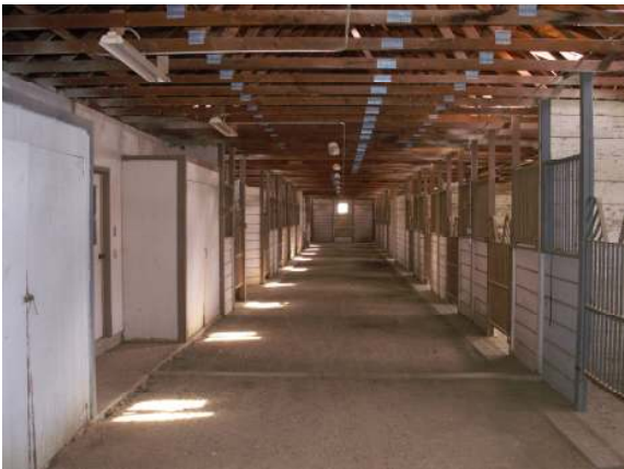
Inside one of the barns