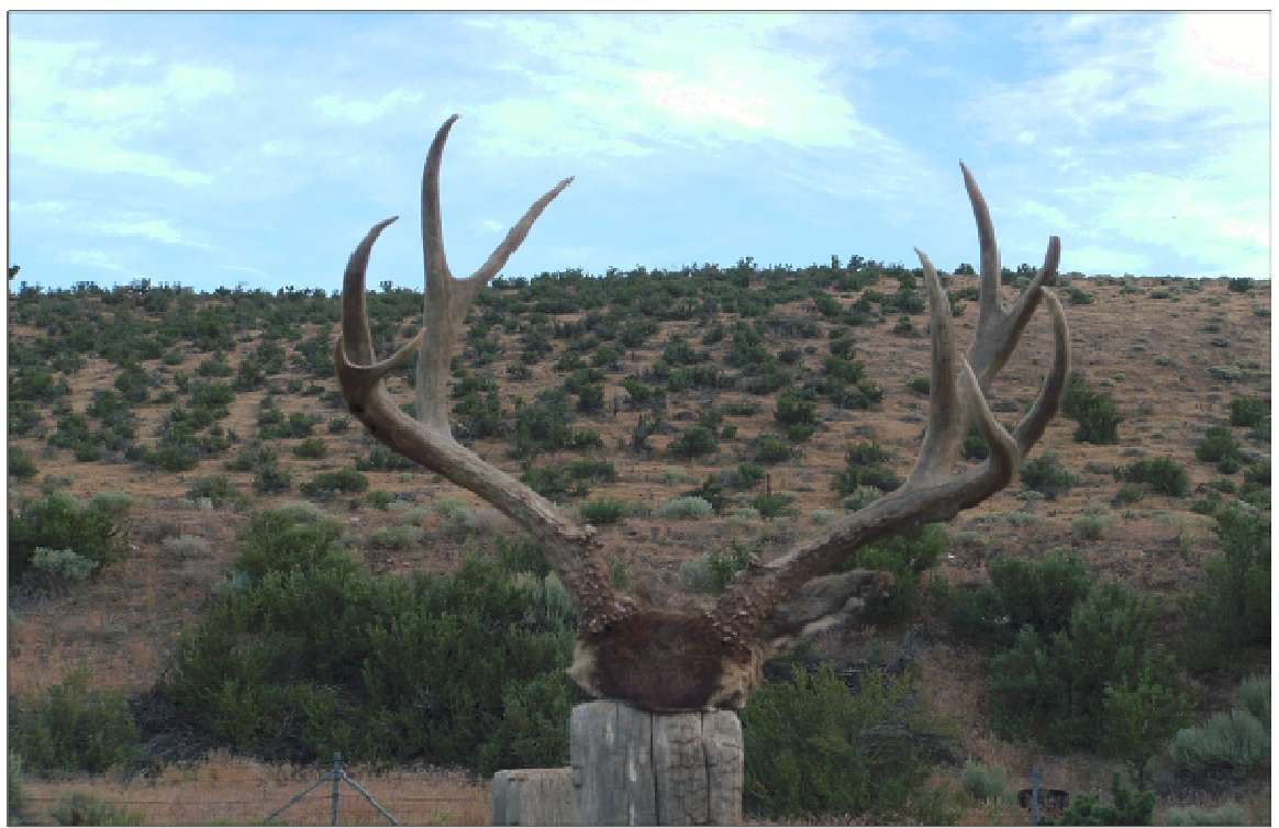
One of the Bass Hill deer

The Property is definitely in a recreational wonderland. The Bass Hill Wildlife Area is near the property and is well known for its legendary mule deer. The ranch sits next to the path of the migration route and you can see hundreds of deer crossing the meadow to head to their winter ground. The ranch is just west of Honey Lake. "Honey Lake Wildlife Area (HLWA) was originally acquired to provide nesting and brood-rearing habitat for resident waterfowl, which is still a very important activity. Since its beginning, the Wildlife Area has expanded, and during peak migrations as many as 30,000 snow and Canada geese and 20,000 ducks have been observed daily. During the winter, a number of bald eagles can be observed at the HLWA, and during the spring, the threatened sandhill cranes and other sensitive species such as the white-faced ibis and bank swallow can be found. Ring-necked pheasants and California quail can be observed year-round". For the angler, the real gem of the area is Eagle Lake. The lake, only 31 miles from the property, is famous for its special species of trout. The eagle lake trout are big, bold and tasty. Anglers from throughout the West Coast annually flock to Eagle Lake with hopes of catching this great tasting fish. Trolling is the most popular method of luring in the trophy trout. The Eagle Lake Marina is a great place for fun. The marina has a launching dock and