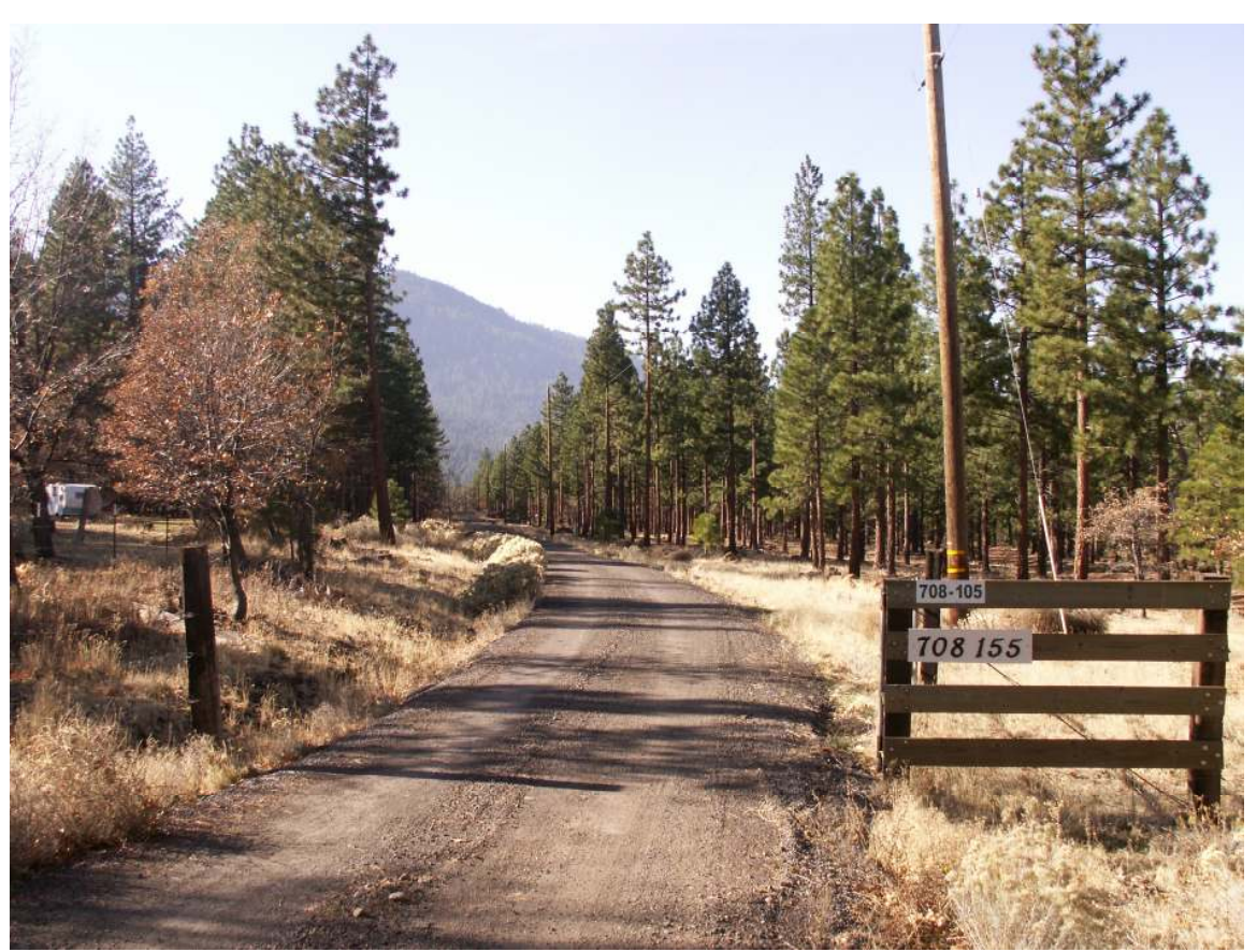
Next door neighbor

The climate is nearly ideal, generally dry, warm days and cool nights, with an average summer high of 89 degrees and daytime temperatures in the 40's during the winter months. This is really a four season area. A recent article in Outdoor Life magazine named