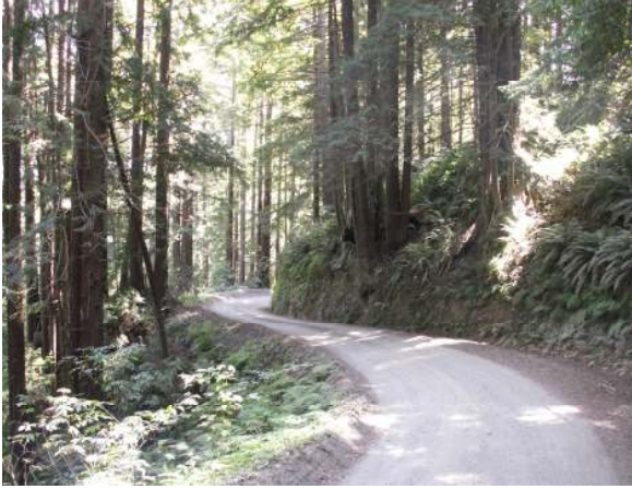
Camp One Road to cabins