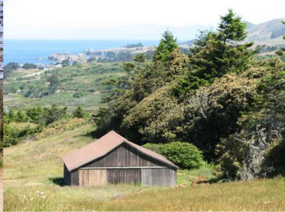
1600 sq ft redwood barn