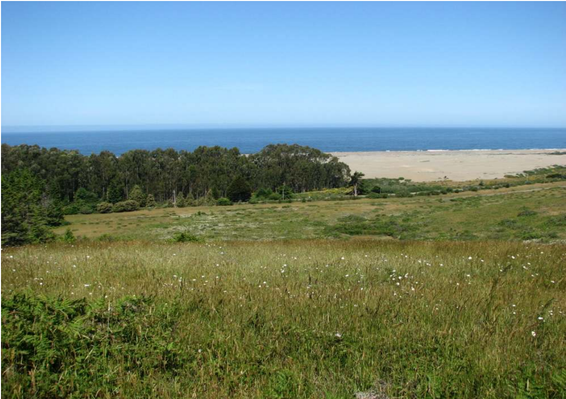
View from the Inn location looking at McKerricher State Beach

This property is a recreational playground. You can walk to the ocean and hike for miles on McKerricher State beach. You can go fishing, surfing and sand dunning. The real jewel of this property is horseback riding. People pay lots of money to ride at Ricochet Ridge Ranch in FT. Bragg. It was recently named by Outside magazine as one of the top 25 trips of a lifetime. You can do this for free on your own property. The river, meadows, and forests all make for great