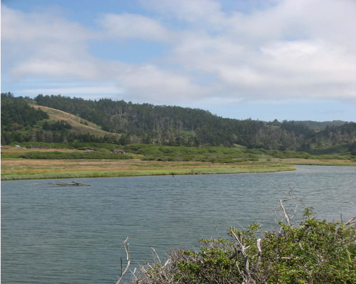
View from Parcel 3 looking North on the Ten Mile River

The ranch consists of five parcels created by certificates of compliance merging preexisting assessor's parcels. The individual parcels, zoning, and short description are presented as follows: