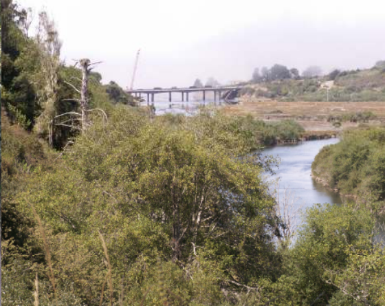
Ten Mile River to Ocean