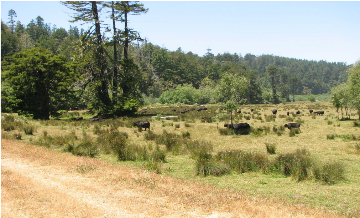
View from Phil's cabin

This 468 +/- acre ranch is located in Mendocino County about 6 miles north of the town of Ft. Bragg, CA. The scenic drive through the redwoods and wine country takes about three hours from the San Francisco Bay Area. This ranch has it all; ocean views, beach access, river frontage, redwood forests, cabins, meadows and income. Ft. Bragg is the biggest coastal town on the Northern California coast with 7000 residents. Ft. Bragg, as its name suggests, was started as a fort during the Civil War. Because of the Noyo harbor and the access to Redwood trees, it became a very successful lumber town. The mill closed in 2002. Because of the picturesque views of the Pacific Ocean and rugged Northern California coast line, tourism is a big industry in Ft. Bragg. The closest airport is in the town of Little River, 21 miles from the property and for commercial flights would be San Francisco at 196 miles. There is an old landing strip on the property that can be updated. A ranch like this one rarely comes on the market. The possibilities are endless. There is approval for a 20 unit Ten Mile Inn with ocean views and direct beach access. You can ride your horses from the ranch to the beach. The property has ten cabins that can bring some needed income or convert them into a great family compound. There is river frontage with wetlands and tidal marshes. There is harvestable timber and meadows for cows and horses. Come see this spectacular ranch and see what the California coast is like.