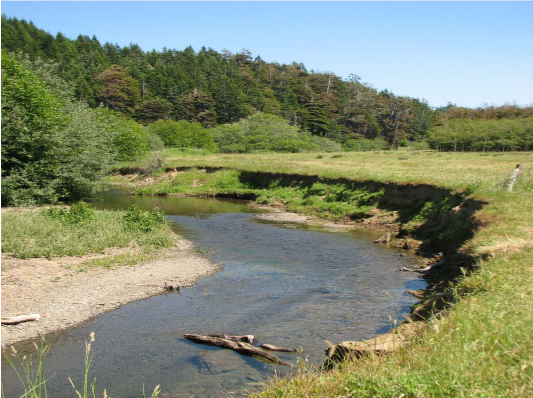
South Fork Ten Mile River winding through the meadows

trails. For the hunter, you are in the A zone and deer tags can be bought over the counter. There are plenty of deer to keep you busy and you will be competing with the black bear for the blackberries. The Ten Mile River is currently being restored to bring back the Salmon and Steelhead. You will need to check with the local fish & game on regulations for fishing the river for salmon, steelhead and trout. There are plenty of waterfowl in the tidal marshes and turkey, quail and some dove for the bird hunter. The drive from the Bay Area will keep your wine cellars full from the local wineries. Within 90 minutes from the property there are over 20 wineries, many with tasting rooms and gift shops. Mendocino County is truly America's greenest wine region as famous for its untamed beauty, wide open spaces and earth friendly farming and ranching as it is for the wines produced in its diverse soils and microclimates.