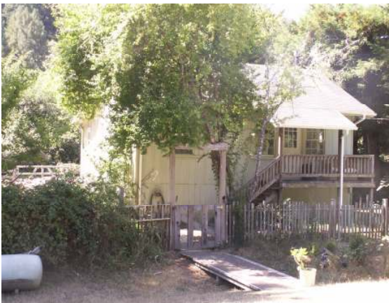
Cabin #1: 1016 sq ft, 2 bd, 1 ba, rent $1,000 month Cabin #2 936 sq, 2bd, 1ba, rent $250a month