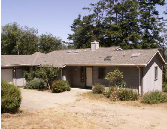
2134 sq ft main house 3 bd, 2 ba

The property has a main home and 9 cabins. The main house is a three bedroom two bath structure containing approximately 2134 sq ft which was built in 1991. It has beautiful river and ocean views. It is very private with its own entrance. It has power, septic and served by a well and a 1500 gallon water tank. The 1600 sq ft hay/equipment barn was built in 1951 and was recently remodeled. This redwood building sits on the westerly slope directly above the four acre inn site.