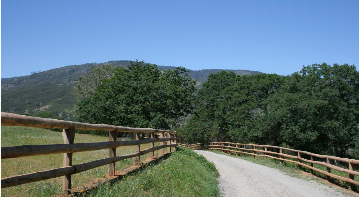
Driveway into property looking west

The property consists of one parcel 022-120-048-0 21.8 +/- acres and is zoned FA –Foothill Ag/Forestry zone. The property sits at the 1200 ft. elevation. The property has varied terrain, with mostly flat and rolling oak grasslands. The property has a nice pond, new lodge pole fencing, nice gravel driveway, fenced pastures, remodeled home and detached garage, new metal barn and the jewel of the property is the deeded 2500 ft runway that is on the shared property with the neighbors, but has access from this property.