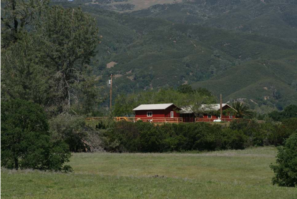
View of House and Garage looking west

This 21 acre property is located in Glenn County about 5 miles from the town of Elk Creek, CA and approximately 25 miles from Willows, CA, 100 miles to Sacramento and 168 to San Francisco. The property lies on the edge of the Sacramento River Valley, framed on its sides by the Coastal and Sierra Nevada Mountain ranges. The 7000 foot Peak of Snow Mountain looms off in the distance from the ranch sitting in Mendocino National Forest. The property has its own 2400' grass airstrip and hangar. For bigger planes the property can be served by the Glenn County Airport in Willows. It has a full service airport with two asphalt runways, 3770 feet and 4120 feet and a great restaurant called Nancy's. For commercial flights, the Sacramento airport is just 100 miles away. The closest schools would be in Elk Creek. Take Highway 5 north and at the town of Willows, turn west on Highway 162 to Elk Creek. In about 20 miles, make a left on County Road 306, go about 1.5 miles and make a right on County road 308. Turn left at the gravel road in 4.2 miles. Go about 2/10 of a mile and make a left onto the property. This is a beautiful property with a deeded runway and nicely remodeled home, garage, barn and lots of horse pastures.