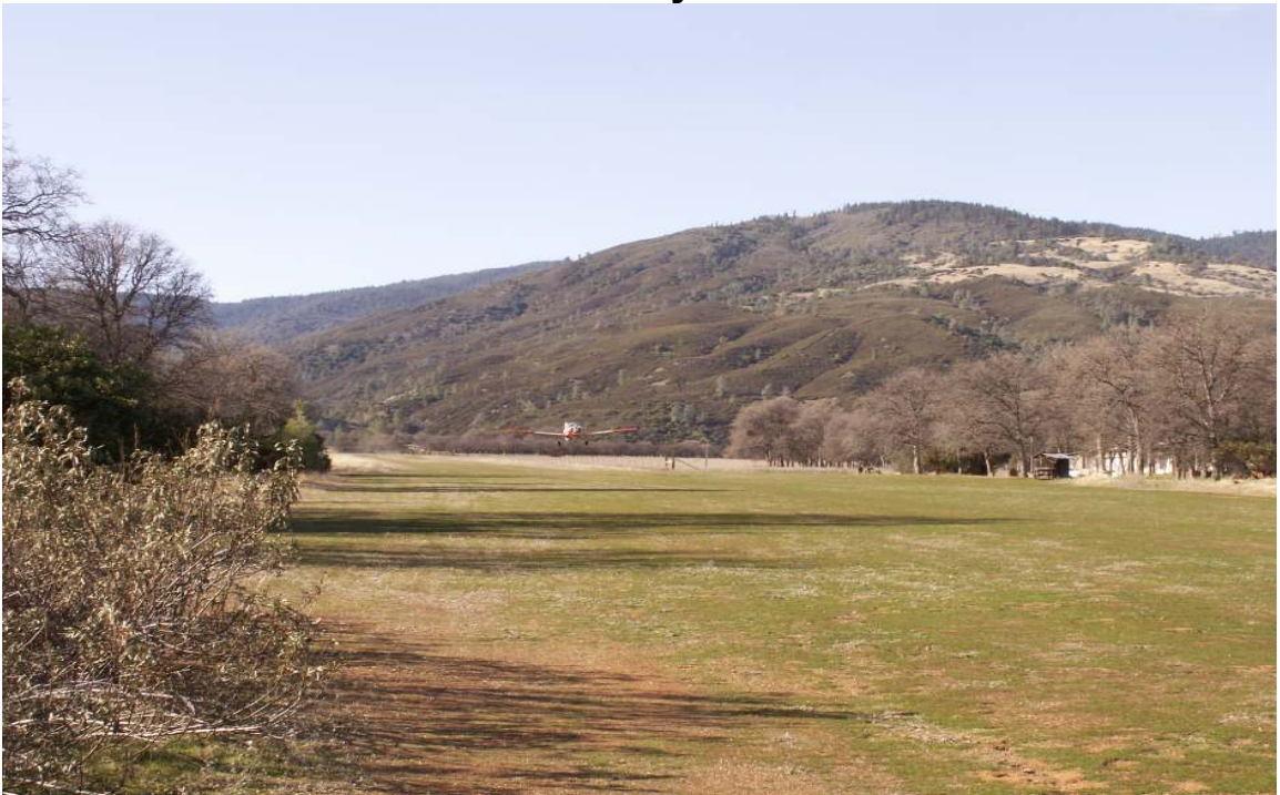
Plane taking off at end of runway