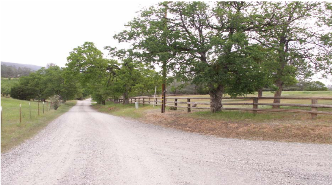
Gravel driveway to property

This is your classic recreational ranch. Just minutes from the Mendocino National Forest, the hunting possibilities are almost endless. The area's rolling oak grassland provides optimum habitat for big game and small game. Trophy