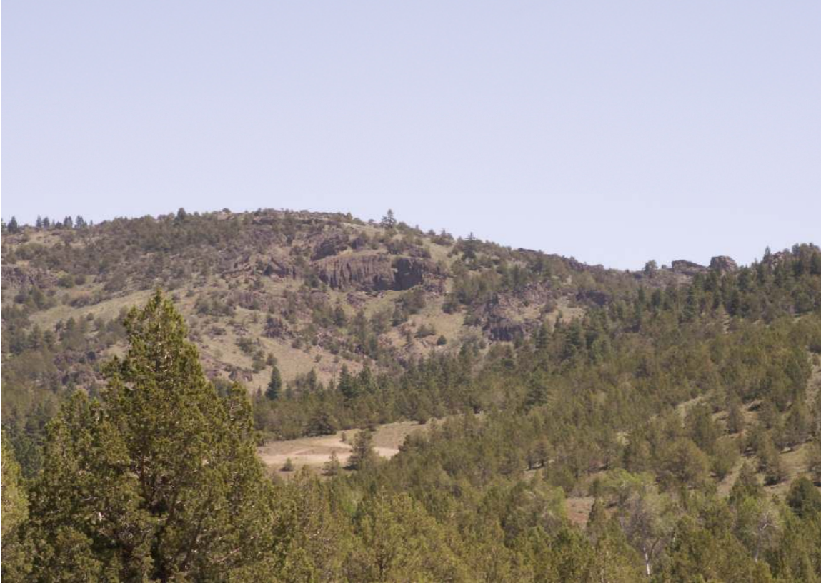
View looking east towards National Forest