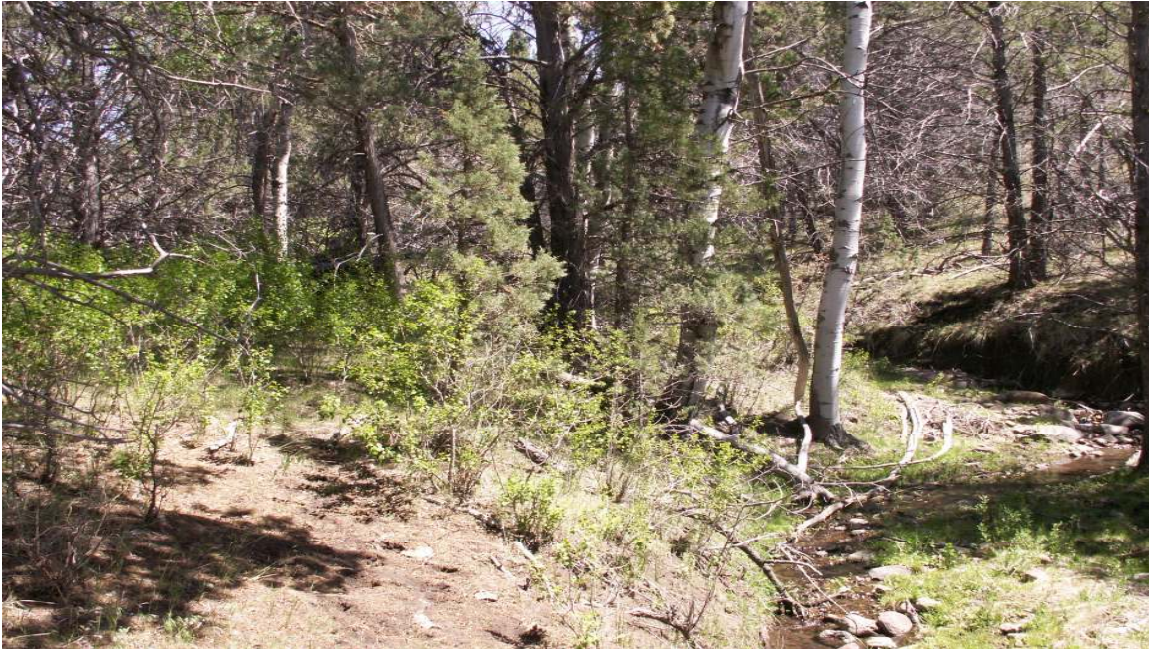
Negro Creek in drought year of May 2009

The property has two developed springs that feed water troughs and several service creeks such as Negro Creek and White Horse Canyon Creek. In addition, there are several unnamed seasonal creeks and springs that could be developed. Any mineral rights will convey with the property. The property has no conservation easements. It is not enrolled in the Williamson Act.