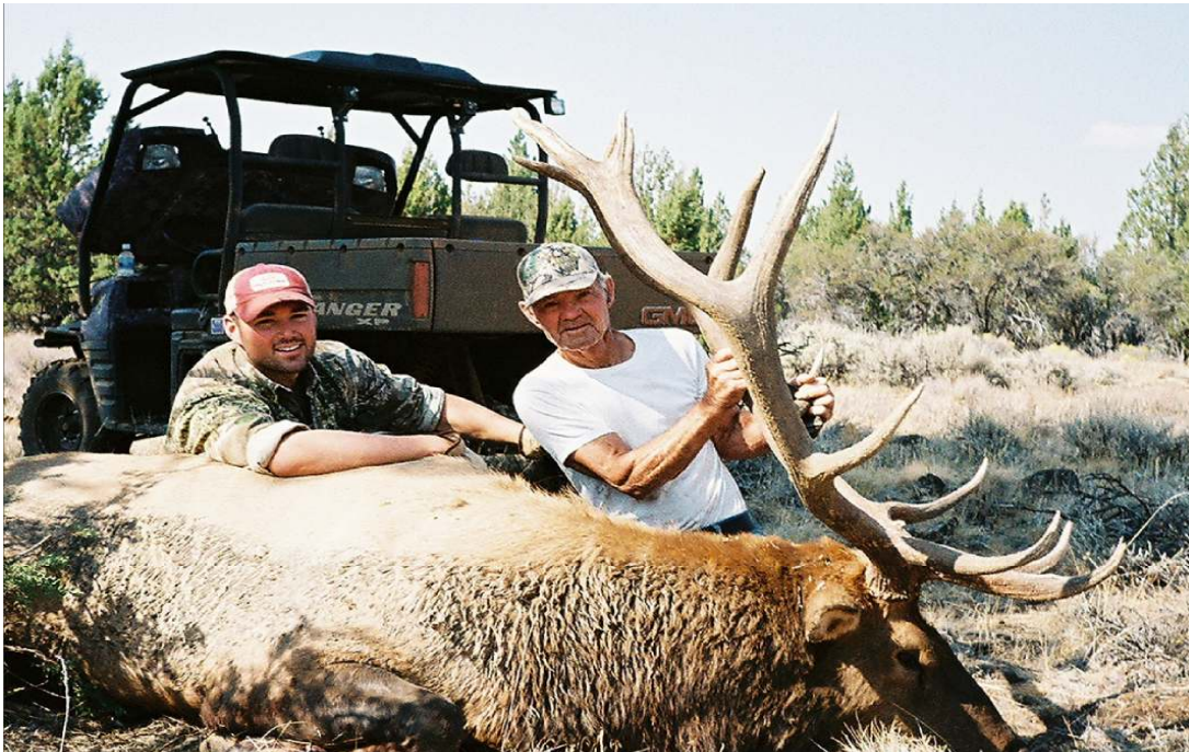
Rocky Mountain Elk from Devil's Garden, Modoc County

This ranch is a recreation wonderland. The access out the back gate to the National Forest gives the hiker, hunter or horse enthusiast miles to roam and explore. For the hunter, the property is located in the X3B zone for deer. The X3B zone has a very high success rate and gets some big mule deer. The property would come with two land owner tags. The properties alignment with the national forest allows views of a lot of game: bear, deer, coyote, badger, antelope, valley quail, mountain quail and grouse. Modoc County is a sportsmen paradise. There are three species of big game hunting, antelope, Mule Deer and Rocky Mountain Elk. The mule deer are here year round, but come in heavy during May fawning season. If you are lucky enough to get a tag, you can go to Modoc National Forest and get a Rocky Mountain Elk. Pictured below is an Elk from the Devils garden area. For the water fowler, Modoc County has some of the best waterfowl staging areas in North America. Tule Lake and Lower Klamath refuges hold superior numbers of Western waterfowl starting in September, and come October, this little basin is a duck and goose hunter's paradise. The property is located just about 80 miles to the Klamath/Tule lake refuge.