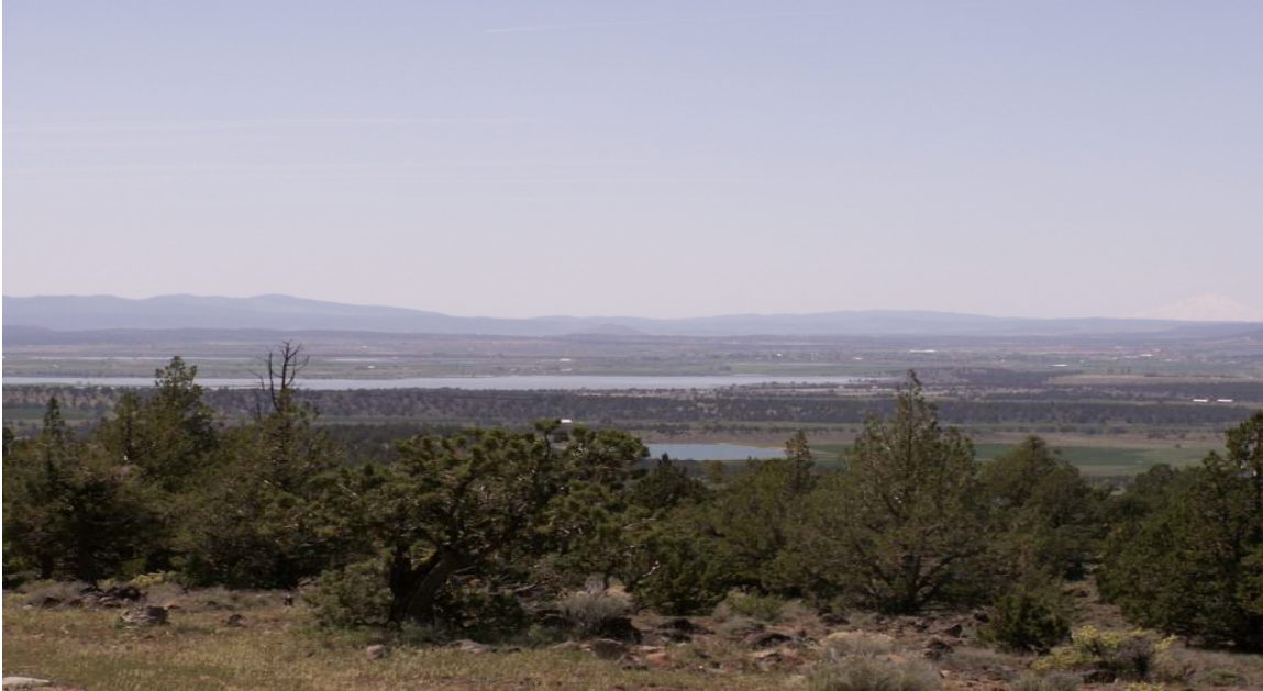
View of Alturas and Dorris reservoir looking West, Mt. Shasta in the background As stated on the Wikipedia website: