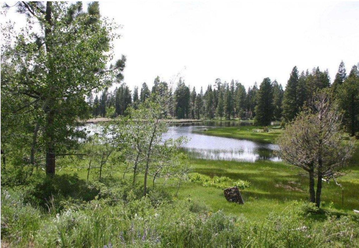
Pepperdine Lake 10 miles from the ranch

opportunities. Many of the lakes are stocked with rainbow, brown and brook trout. For the horsemen, you can ride for miles and miles. The mountains are loaded with wildlife. Mule deer, mountain lion, bear, beaver, bobcats, badgers, martens, porcupines, chipmunks, squirrels, rabbits and weasels. Birdwatchers enjoy quail, dove, geese, duck, woodpeckers, warblers, sapsuckers, flycatchers, owls, hawks, and grouse.