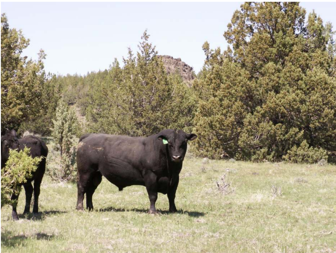
One of the nice bulls on the ranch

The owner currently leases out the grazing rights to a neighbor. The property is fenced and could run 75 to 100 head for the season depending on the year.