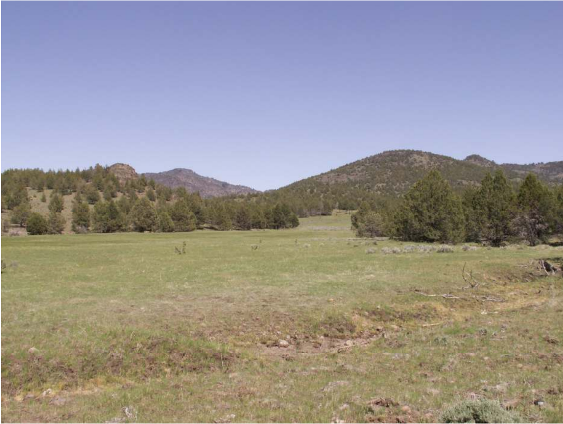
Looking east from the meadow