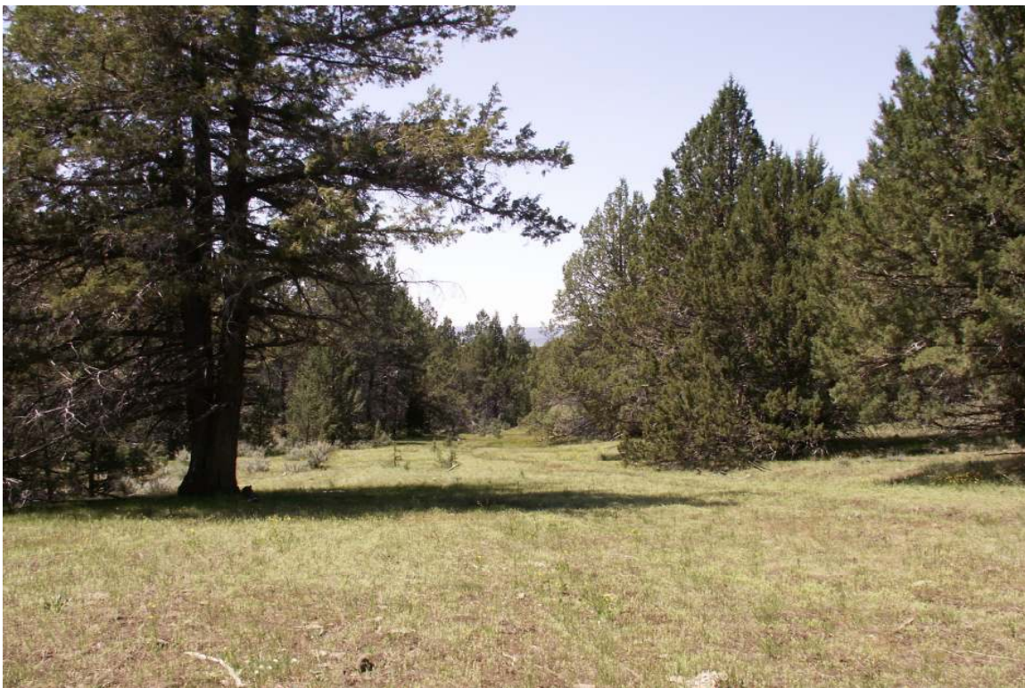
View of one of the meadows looking west