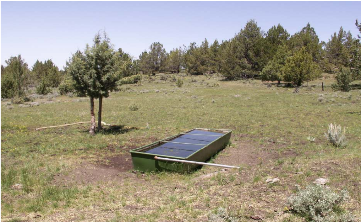
One of the developed springs

The property has two developed springs that feed water troughs and several service creeks such as Negro Creek and White Horse Canyon Creek. In addition, there are several unnamed seasonal creeks and springs that could be developed. Any mineral rights will convey with the property. The property has no conservation easements. It is not enrolled in the Williamson Act.