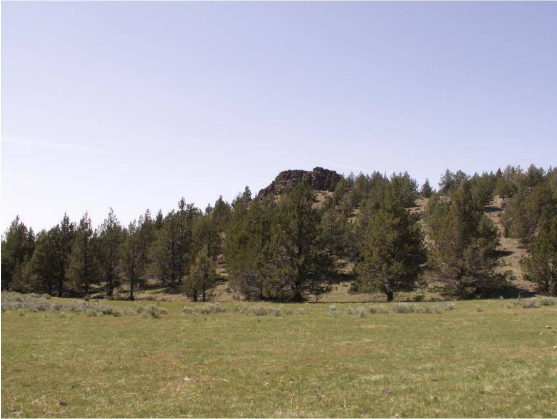
Looking Northwest at Castle rock

The property consists of 12 parcels for a total of 2080 acres. The property is zoned unclassified agricultural use and is not in the Williamson act. The property could be subdivided. The 12 parcels are legal parcels and make this ranch a great investment property. The property sits at the 4800 ft elevation and rises to 6000 feet in the back of the property. The property has moderate to gently sloped terrain on the lower elevation and steep hilly terrain on the upper elevations. The property has a nice 60 acre meadow with various deciduous trees on the stream corridors and of course scattered Juniper trees though out the ranch. The ranch borders National Forest on the east for several miles and has 1/2 mile county frontage on Road 58B.