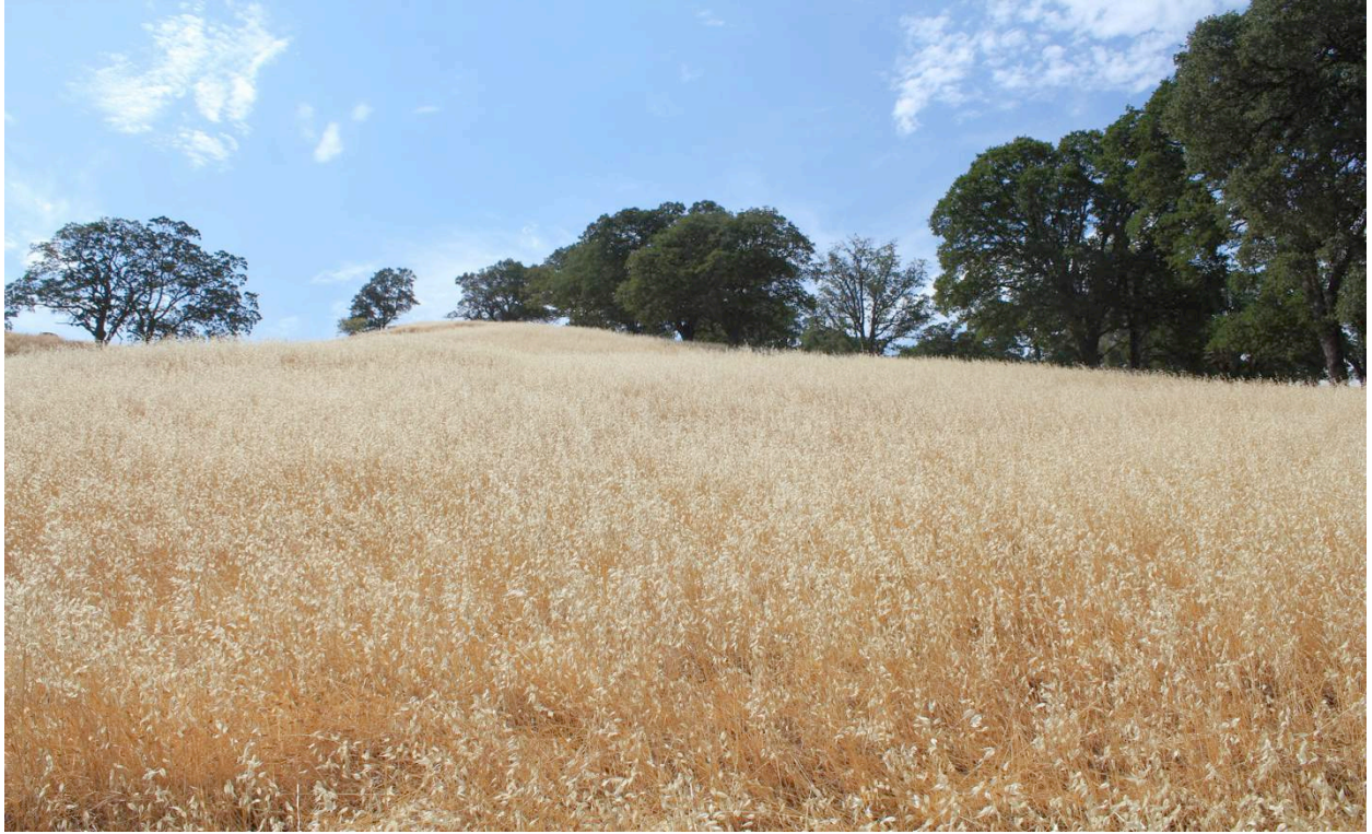
Some nice feed for livestock