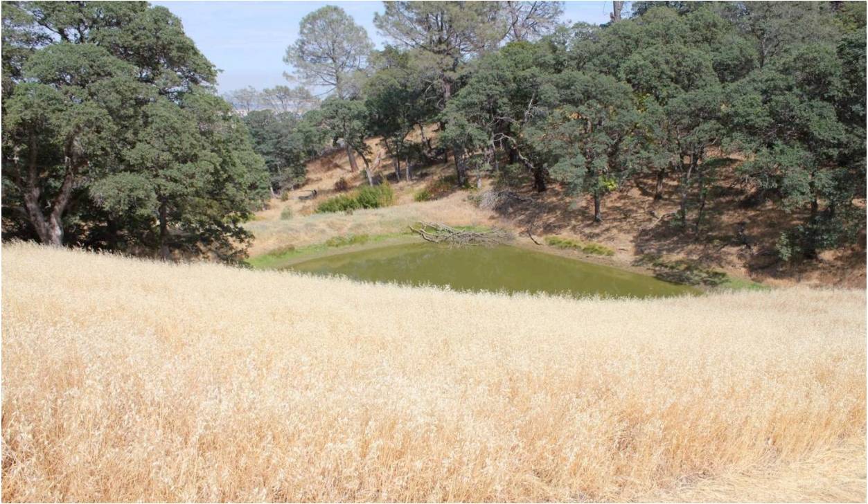
View of the year-round pond

The ranch has two large wells on it making water not a problem. Each providing up to ____ gpm. The property also has a couple of good sized ponds. Depending on the year some of the ponds last year round and other dry up during the summer. This ranch has potential for both livestock and farming. Most of the property is fenced and could be ready to go. The Power is available from PG&E and there are poles all around the property. There are currently no septic systems in place and one would be needed for a home. Please contact the Solano County for specifics on Septic systems and uses.