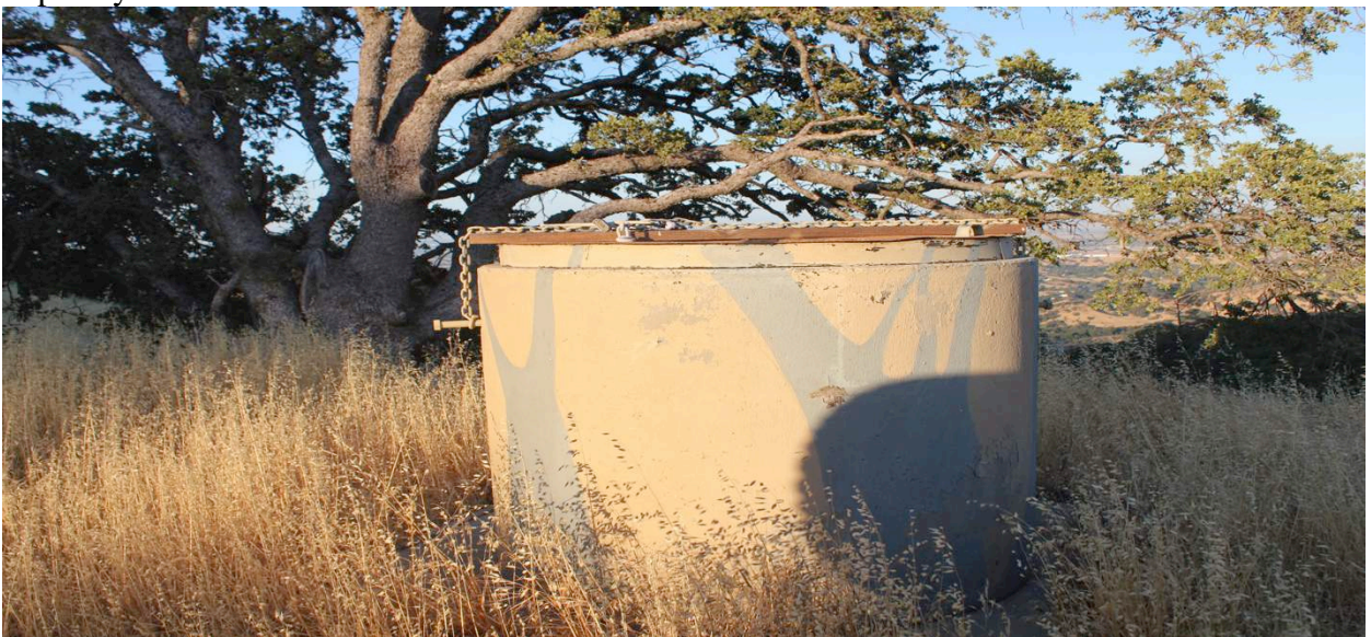
One of two wells

The ranch has two large wells on it making water not a problem. Each providing up to ____ gpm. The property also has a couple of good sized ponds. Depending on the year some of the ponds last year round and other dry up during the summer. This ranch has potential for both livestock and farming. Most of the property is fenced and could be ready to go. The Power is available from PG&E and there are poles all around the property. There are currently no septic systems in place and one would be needed for a home. Please contact the Solano County for specifics on Septic systems and uses.