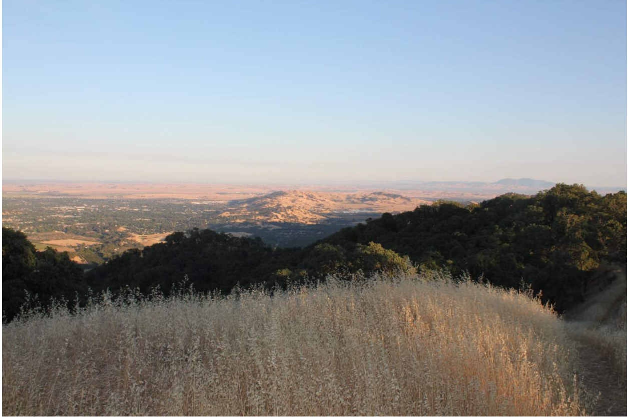
One of the many beautiful views on the property

The 412.53 +/- acres currently has seven parcels.