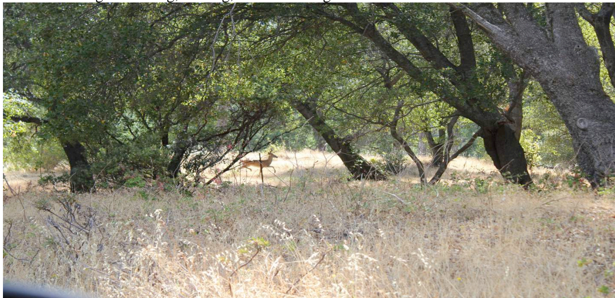
Another buck in July

The Pleasants Valley Ranch is only five miles from downtown Vacaville, but it feels like hundreds of miles away. There is great turkey hunting and deer hunting. As soon as we entered the property we saw deer and lots of trails and signs. The picture above is one of the bucks we saw in July. It is rare to find such a large piece of land that is loaded with game so close to town. Having a great hunting ranch like this one in Vacaville has many perks. With the easy access to Interstate 80, you can be on the freeway in minutes and head up to Lake Tahoe for skiing or drive over to Napa for some wine tasting. The ranch is just 20 minutes from Lake Berryessa where there is great fishing, boating, and swimming.