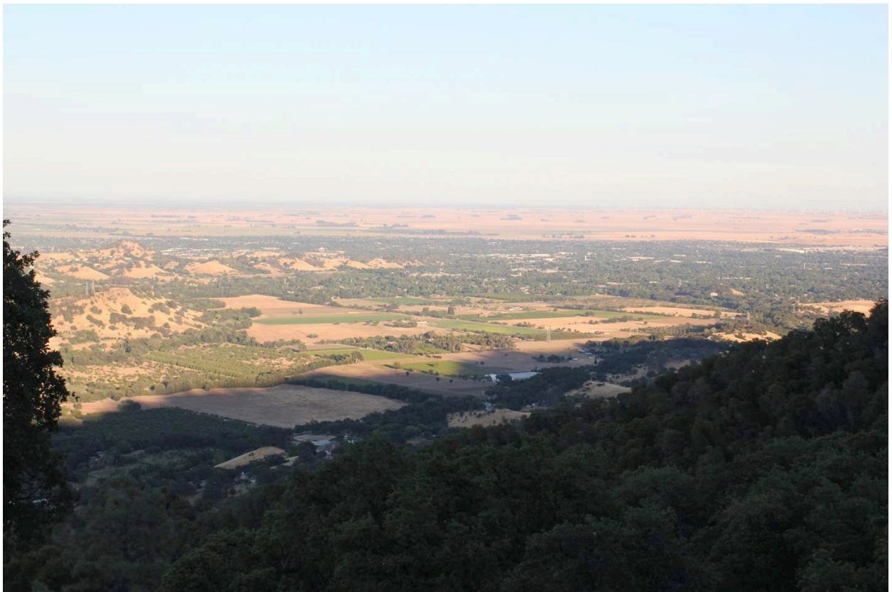
View of Pleasant Valley