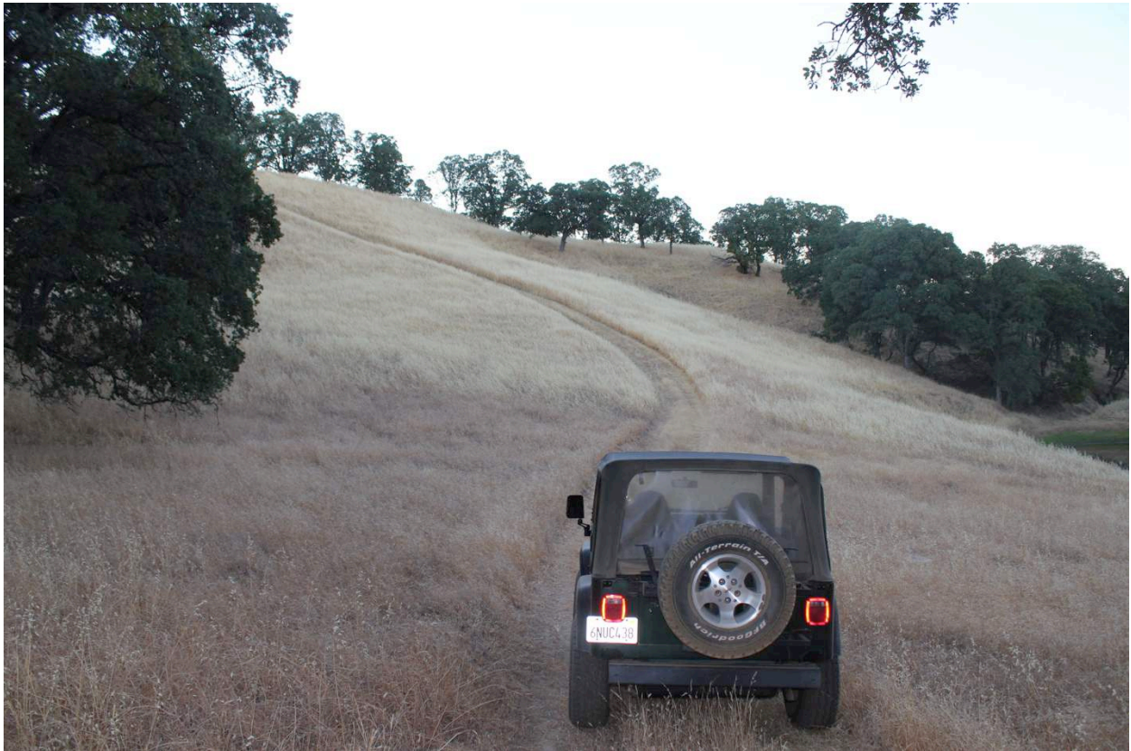
View of one of the many grassy hill sides on the property

The 412.53 +/- acre Pleasant Valley Ranch is in northern Solano County. The ranch is located in Vacaville, CA, just over an hour away from San Francisco and only 41 miles from downtown Sacramento. Vacaville has a great location with day trips to the Napa wineries, Lake Tahoe and the Sacramento delta. Vacaville has over 94,000 residents, but still has the small town feel to it. There is also a beautiful historic downtown where you can always find something going on. The property can be accessed by taking the Cherry Glen exit off of I-80 E. Then turn left onto Lagoon Valley Rd., keep right and continue on Cherry Glen Rd. and then take the first left onto Pleasants Valley Rd. Go about 5 miles and make a left on Pleasant Hills Ranch and a quick right, the property will be at the end of the road with a locked gate. The property is currently being used as hunting ground but it also has potential for livestock and/or farming use. It has incredible Black tail deer and turkey hunting. Within minutes of being on the property you'll see some of the Black tail deer roaming about. The closest airport would be the Nut Tree airport in Vacaville and the closest commercial airport would be Sacramento, CA which is approximately 49 miles from the ranch. If you think this may be the ranch for you please call the office for an appointment.