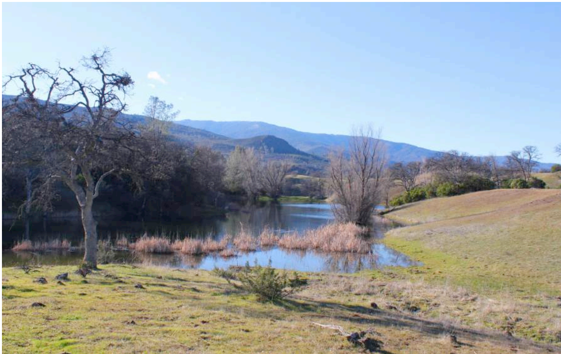
One of the hidden ponds looking at Witches Hill (on ranch)

The ranch has pleasurable warm summers and mild winters with beautiful, satisfying spring and fall days. This makes the ranch a year round paradise.