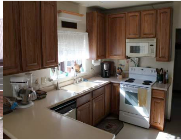
Main home kitchen

This 1500 sq ft 3 bedrooms, 2 baths home is nicely cared for and move in ready condition. The headquarters has a great barn, shop, guest cottage and caretaker home. The grounds are well maintained, fenced and with lots of room for vehicles and equipment.