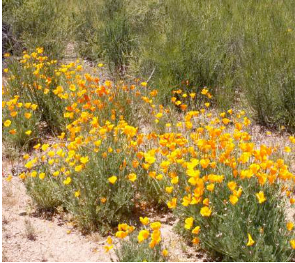
Poppies in spring