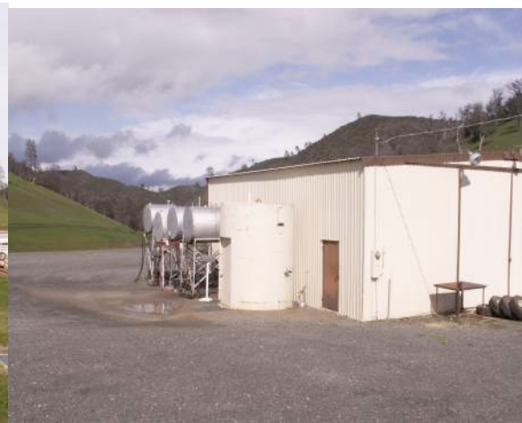
Shop and tanks