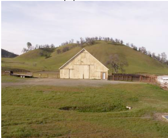
View of barn

This 1500 sq ft 3 bedrooms, 2 baths home is nicely cared for and move in ready condition. The headquarters has a great barn, shop, guest cottage and caretaker home. The grounds are well maintained, fenced and with lots of room for vehicles and equipment.