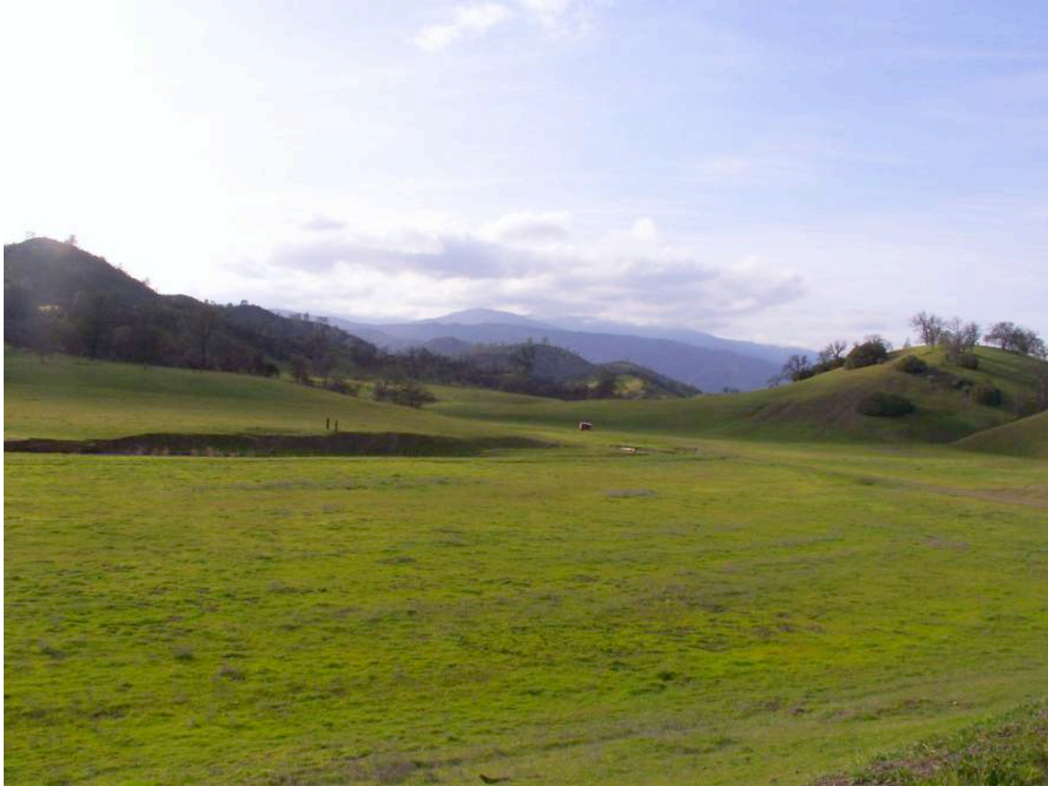
Looking north up Green Valley, March 2011

A detailed description of the APN #'s and zoning classifications is available upon request. About half of the ranch is in the Williamson Act. The taxes for the ranch last year were about $21,059 a year.