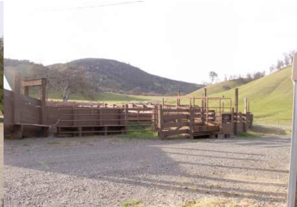
Corrals looking west