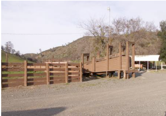
Corrals looking east