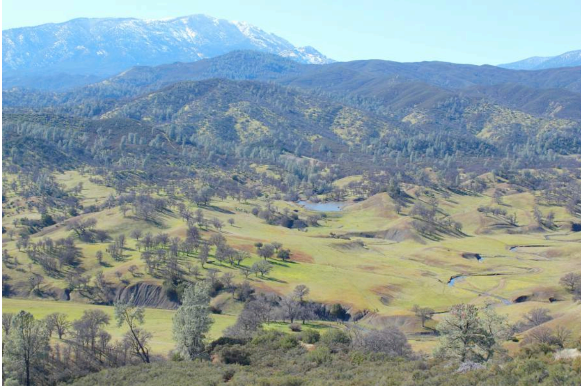
Beautiful Valley with Snow Mountain in the backdrop, Feb 2011