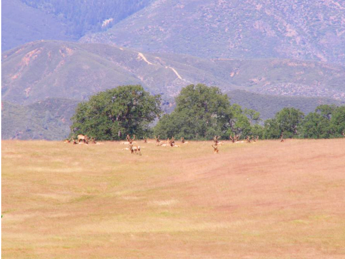
A herd of Elk just a few miles from the ranch

This is a recreational dream with big oak grassy valleys that blend into the hills. The hills of chaparral have manzanita, buckeye, chemise, redbud, live oak, and grey pine. Beautiful conglomerate rock formations can be found throughout the ranch. Year round creeks, seasonal creeks and year round reservoirs provide plenty of water for game. Black tail deer, bear, wild hogs, turkey, quail, and predator hunting would keep you hunting all year. The ranch is located in the heart of Tule Elk Country. The Elk can be seen occasionally on the ranch. To hear them bugling is a sound you will never forget. The ranch is located in the A zone and hunting tags can be purchased over the counter. It would make a great equestrian estate with trails, barn, or build yourself a new riding arena. The real gem of the property is the water. With over 3000'ft frontage on Briscoe Creek and 7 year round ponds, you have plenty of opportunity for fishing, and swimming. The East Park Reservoir is just down the road with great boating, swimming and fishing. As stated on the East Park Reservoir website: