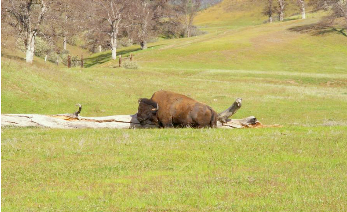
The owners pet Buffalo rubbing on a tree

The beauty of this ranch is its diversity. You have the ability to run cattle, buffalo, and horses. The weather really dictates the number of Animal Units, but you can safely run 200 pair for the season and a 100 pair year round without feeding. In some years you can run more and in some years you should run less. It has been traditionally used as a winter grazing outfit with the cows arriving in mid November and shipped out in mid-May. The ranch is fenced and crossed fenced with good solid barbed wire. The corrals are located by the ranch house with a good gravel road and very functional facilities. The ranch is well watered with a year round creek, seasonal creeks and over seven year round reservoirs. The pastures are fertilizer and pesticide free making it a potential natural organic beef operation.