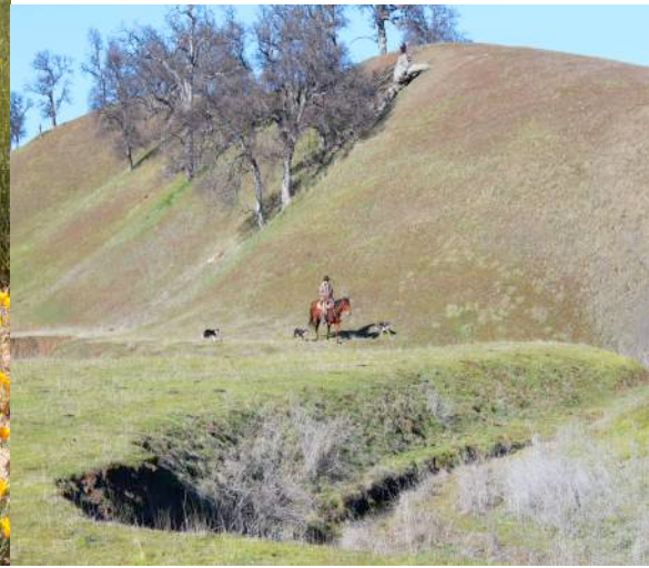
Looking for cows