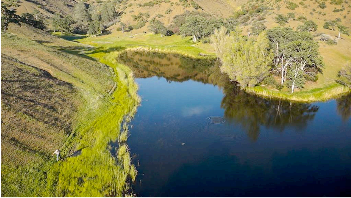
One of the seven year round ponds, Feb 2011

Water is gold and this ranch has lots of it. The seven ponds provide water year round and sustains great wildlife habitat. Green Valley creek is seasonal, but has good water flow in the winter time and runs for almost 5 miles. There is also a year round creek with over 3000' ft frontage on both sides, known as Briscoe creek, that will keep the fisherman happy. The headquarters home is fed from a well and provides plenty of water for the house and landscape. The other modular home is fed from its own well.