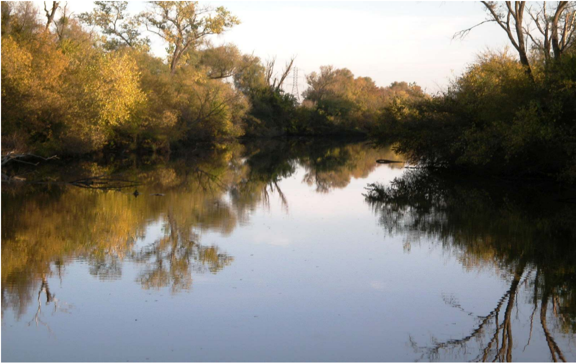
Riparian ponds that are excellent for Wood Ducks

The properties APN# is 025-200-042 for 304+/- acres. The property has a FWS conservation easement. The owner will convey any mineral rights that they own. The wetland restoration was carefully designed by Ducks Unlimited for a hunter.