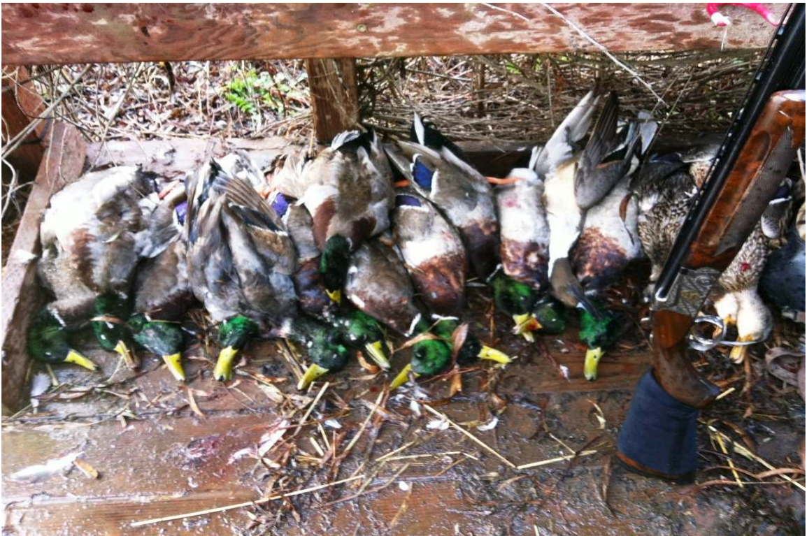
How many mallards do you see?

The club has PG&E power on site and uses a two year old 25HP lift pump to flood the fields. The water is taken from the Sutter Bypass East/West Channels. The property comes with a water license. The property has a great landing site for temporary trailers, house boats, boats and storage.