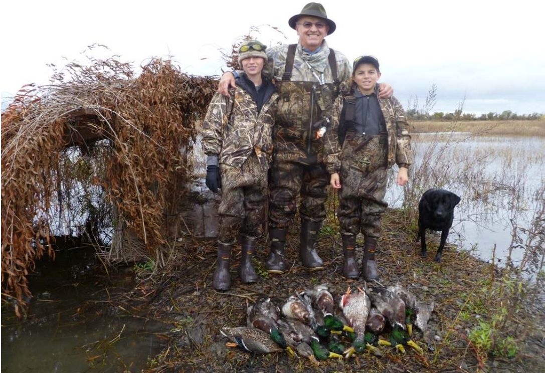
Another generation of hunters.

The property was carefully laid out with nine blinds. The new blinds all have room for three hunters in each blind and all are accessible by boat. The riparian area along the East and West Channel offer great Wood Duck and Mallard hunting. In 2011, the club shot just under 600 birds with 230 Mallards, 140 Teal, 69 Widgeon, 39 Wood duck, 37 Shovelers, 27 Sprig, 20 Gadwall, 9, other, 7 Geese, 1 Canvasback. The average number of ducks killed per day was 14.79, total number of shoot days was 39 days. Average number of hunters per day was 5.03 hunters. The owner leased the ranch out last year and felt that the hunters could have gotten 1000 birds if they limited themselves to two blinds a day with three hunters in each blind. This area is internationally known for its shore birds and the natural marsh has been a haven for many species of shore birds. This is a year round property with Blacktail deer, doves and fishing; bass, catfish, and salmon. The owners had a very successful brooding year with over 200 mallards released.