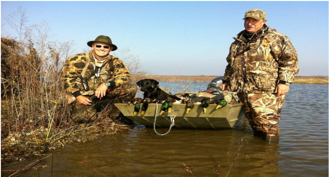
Another Great Morning!

The properties APN# is 025-200-042 for 304+/- acres. The property has a FWS conservation easement. The owner will convey any mineral rights that they own. The wetland restoration was carefully designed by Ducks Unlimited for a hunter.