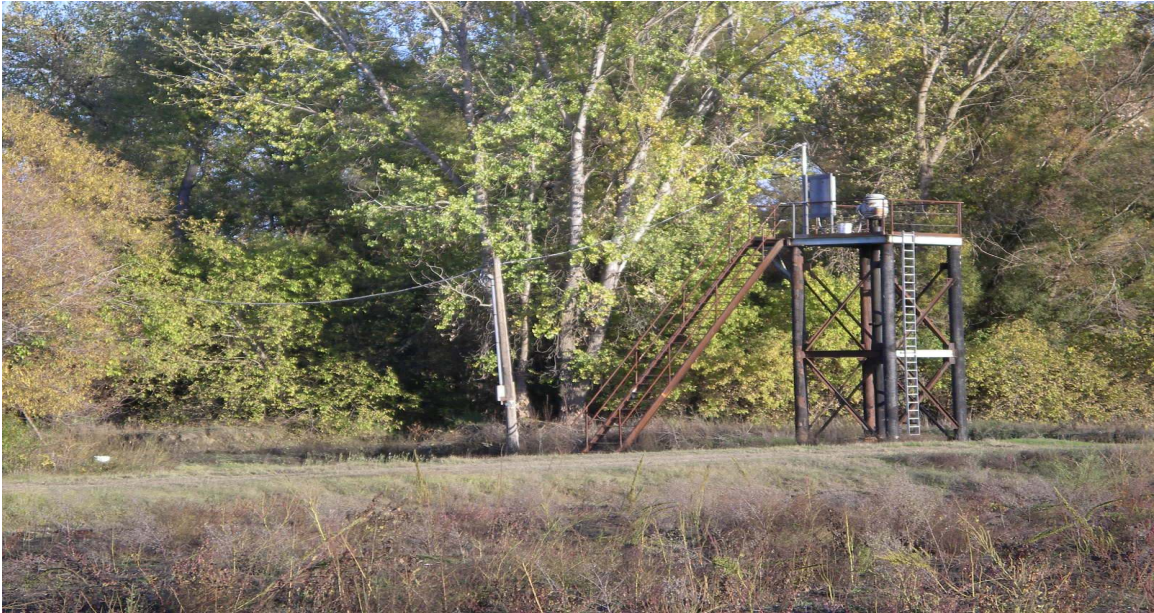
Power and lift pump

The club has PG&E power on site and uses a two year old 25HP lift pump to flood the fields. The water is taken from the Sutter Bypass East/West Channels. The property comes with a water license. The property has a great landing site for temporary trailers, house boats, boats and storage.