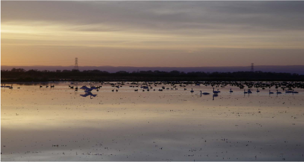
Looking west at sunset

This rarely offered, very private 304+/- acre duck club is a real gem. Once part of the legendary Dingville Duck and Social Club, it has been meticulously restored to natural marsh and upland habitat for waterfowl hunting. The property is located in Sutter County and is just 25 miles north of the Sacramento International airport. The property is very private with two locked gates and gravel roads with year round access. The property is located within the Sutter Bypass and is accessible from Highway 99 and Highway 113. The club has 9 blinds that are fully accessible by boat. Shown by appointment only, locked gates.