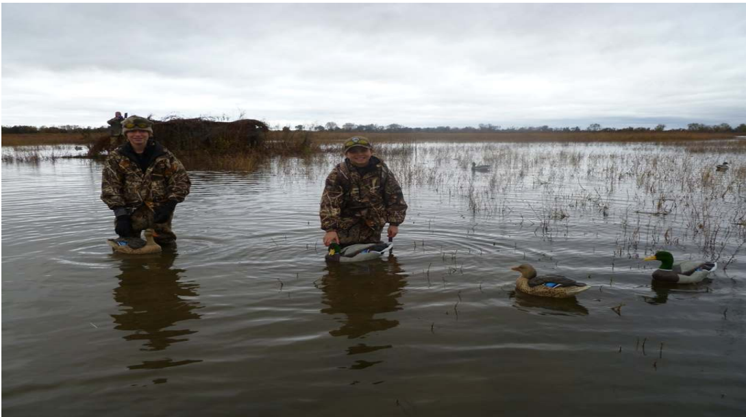
The grandkids putting out the decoys

This rarely offered, very private 304+/- acre duck club is a real gem. Once part of the legendary Dingville Duck and Social Club, it has been meticulously restored to natural marsh and upland habitat for waterfowl hunting. The property is located in Sutter County and is just 25 miles north of the Sacramento International airport. The property is very private with two locked gates and gravel roads with year round access. The property is located within the Sutter Bypass and is accessible from Highway 99 and Highway 113. The club has 9 blinds that are fully accessible by boat. Shown by appointment only, locked gates.